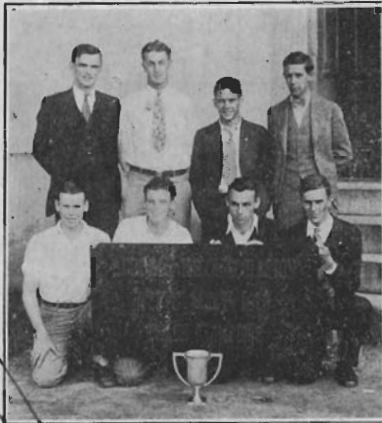
Part of Seventh District Athletic team. State Champions.

Federation of State High School Athletic Associations