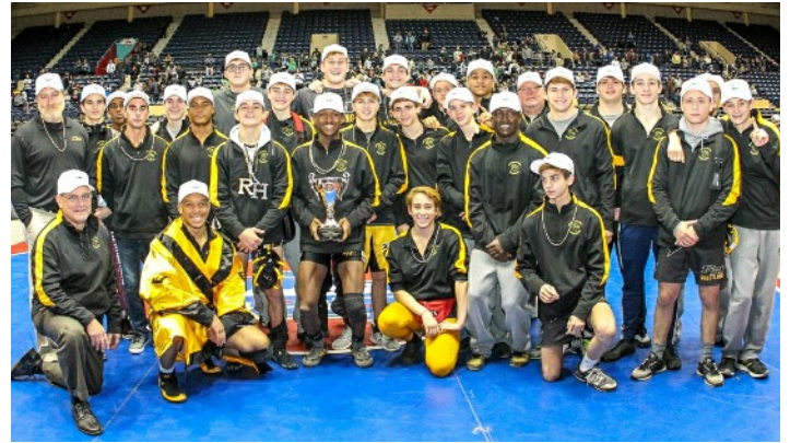
6A: Richmond Hill