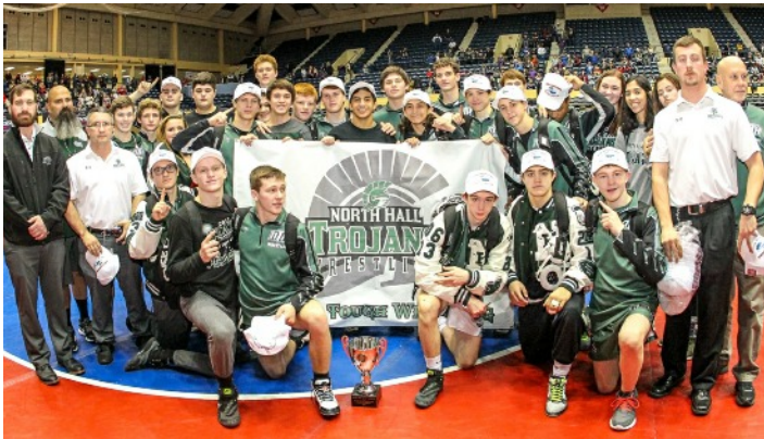
3A: North Hall