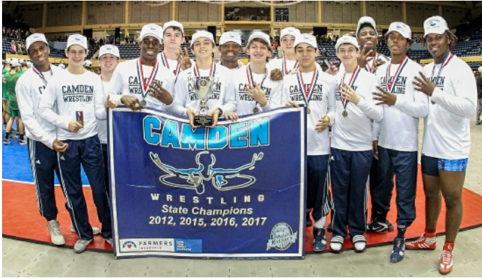
7A: Camden County