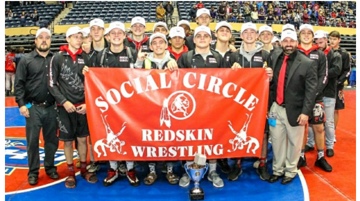
2A: Social Circle