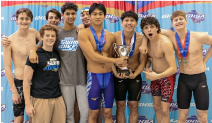
4A-5A Boys: Chattahoochee