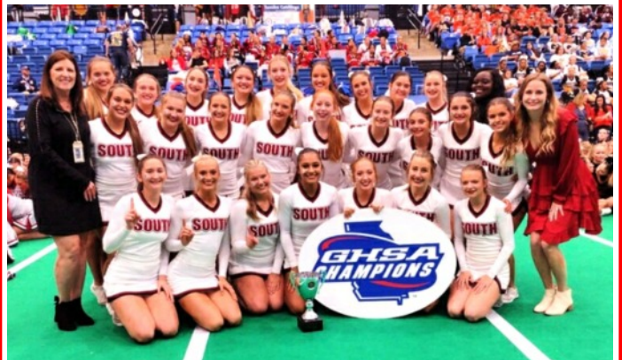
5A-6A: South Effingham