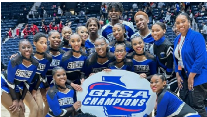
A-2A: Stilwell Arts