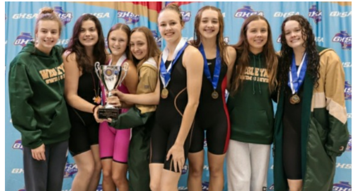
A-3A Girls: Wesleyan