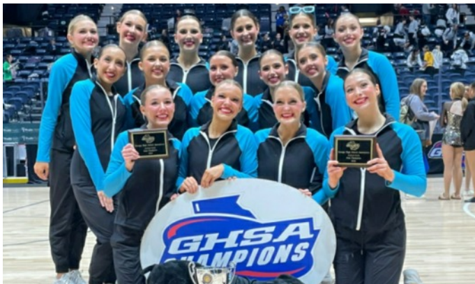
3A-4A: Starr's Mill