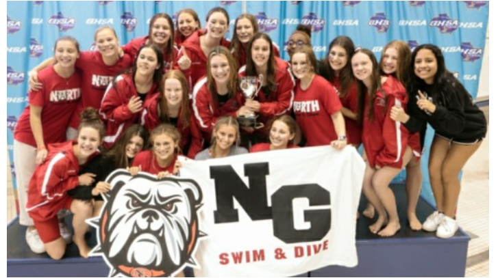
7A Girls: North Gwinnett