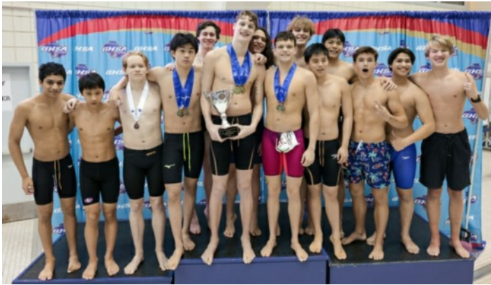
6A Boys: Johns Creek