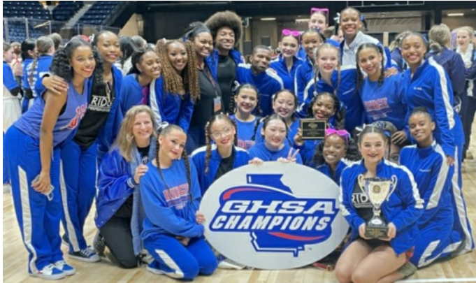
7A: Peachtree Ridge