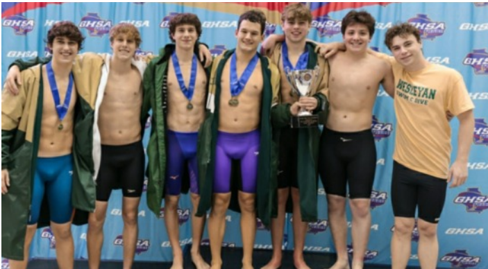
A-3A Boys: Wesleyan