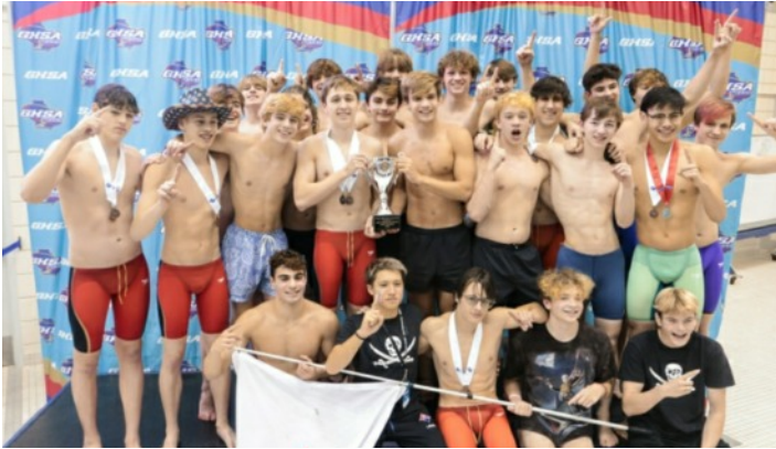
7A Boys: Walton