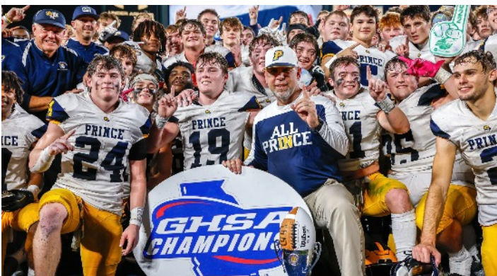
A, Division 1: Prince Avenue