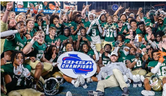
5A: Ware County