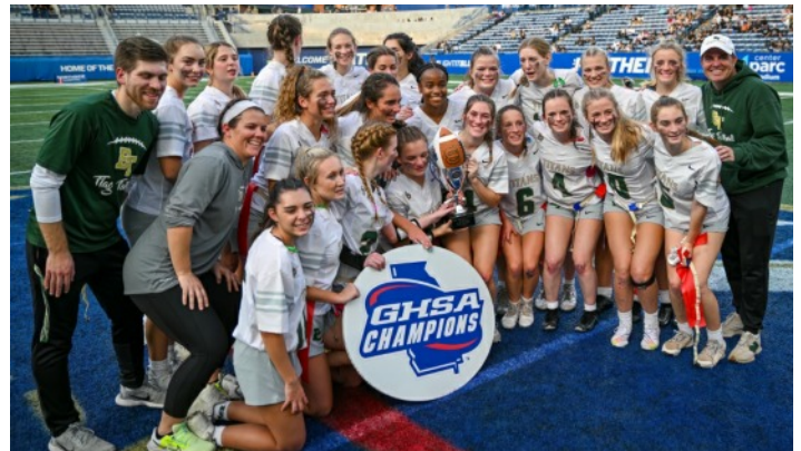
7A: Blessed Trinity

Congratulations to the third ever GHSA Flag Football State Champions. A third division was added in 2021 after two champs were crowned during the initial campaign in 2020. Winning in 2022 were Blessed Trinity (7A), Lithia Springs (5A-6A) and Southeast Bulloch repeating in A-4A. Photos of the other Football champions may be found on the next page.