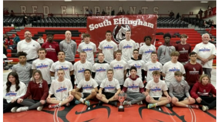
6A: South Effingham