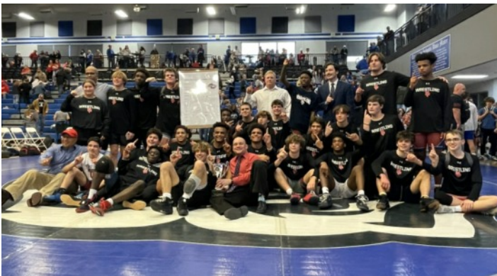
A: Mt. Pisgah