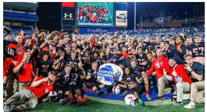
A, Division 2: Bowdon