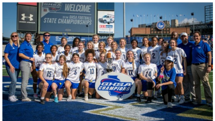
A-4A: Southeast Bulloch