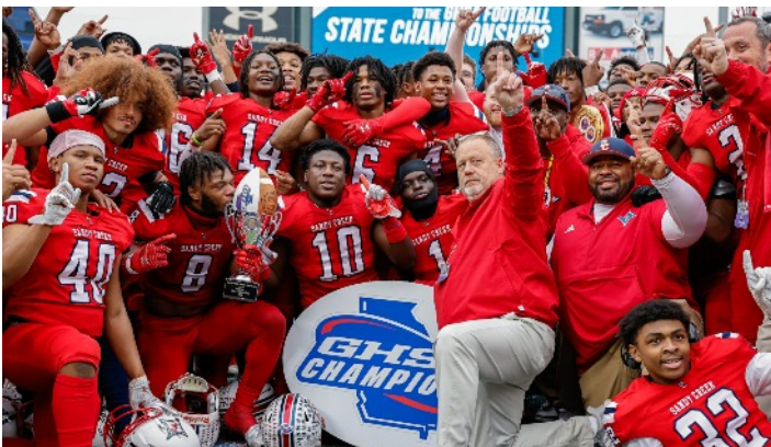
3A: Sandy Creek