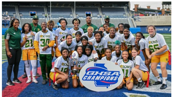
5A-6A: Lithia Springs