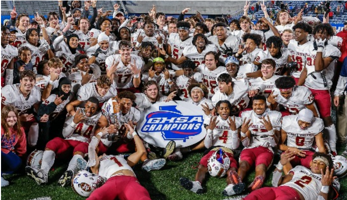
7A: Mill Creek