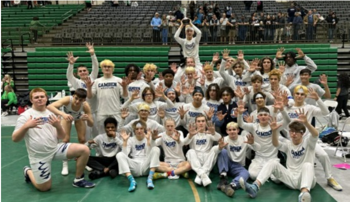
7A: Camden County