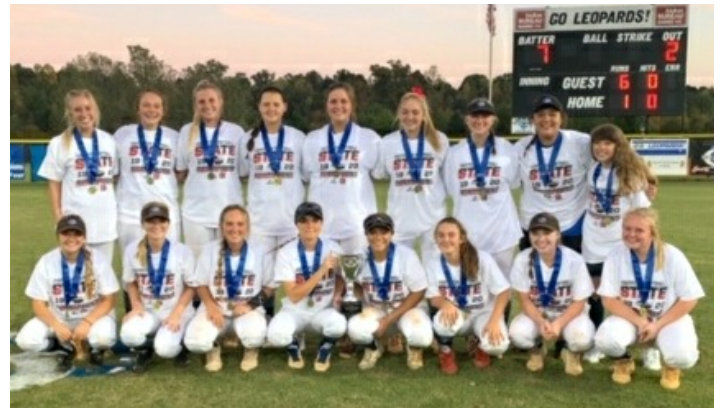
2A: Banks County