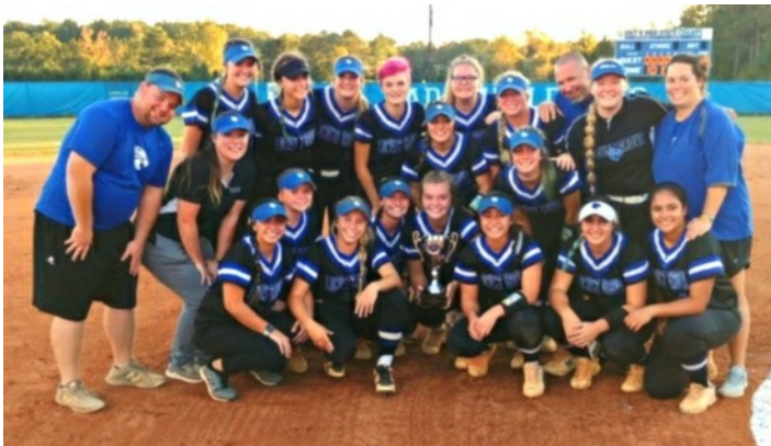
5A: Locust Grove