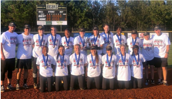
7A: Mountain View