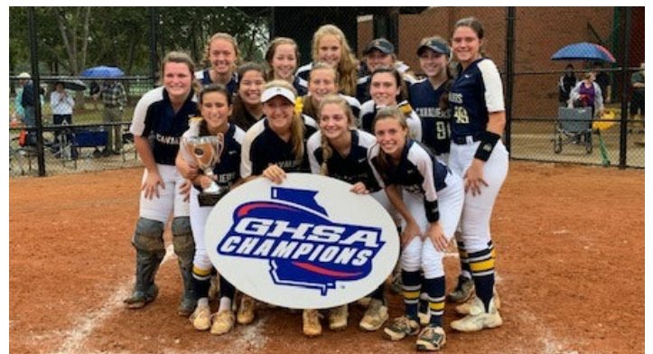
A (private): Mt. de Sales