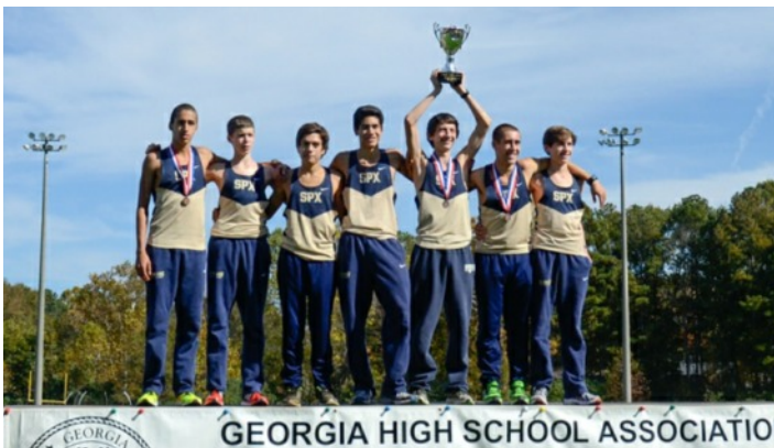
AAAA: St. Pius Golden Lions