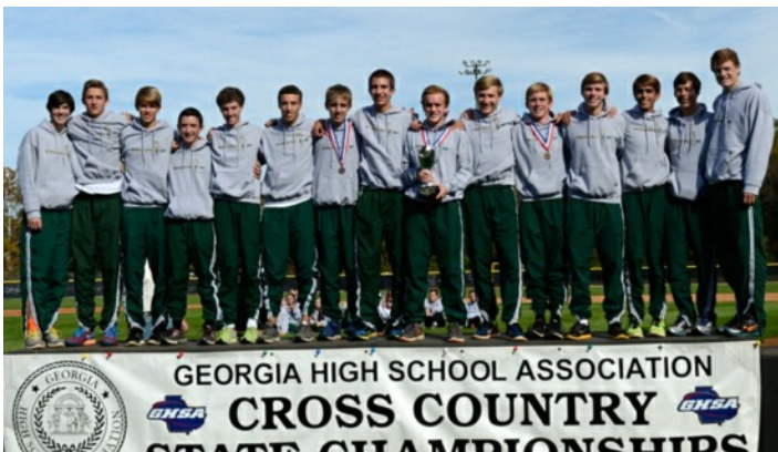
AA: Wesleyan Wolves