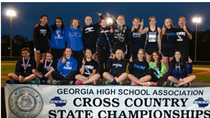
A (public): Towns County Indians