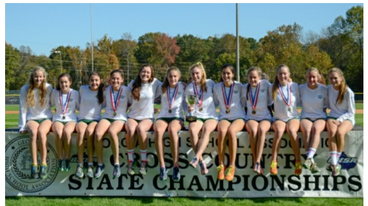
AAA: Westminster Wildcats