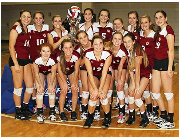
AA: Holy Innocents' Golden Bears