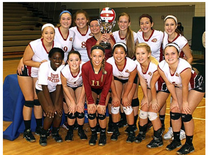
A: Hebron Christian Lions