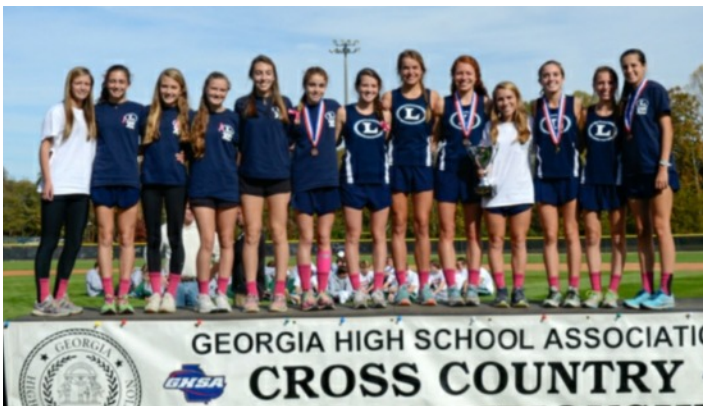
AA: Lovett Lions