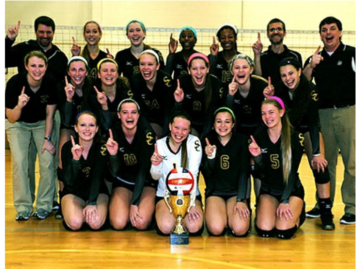
AAAAA: Sequoyah Chiefs