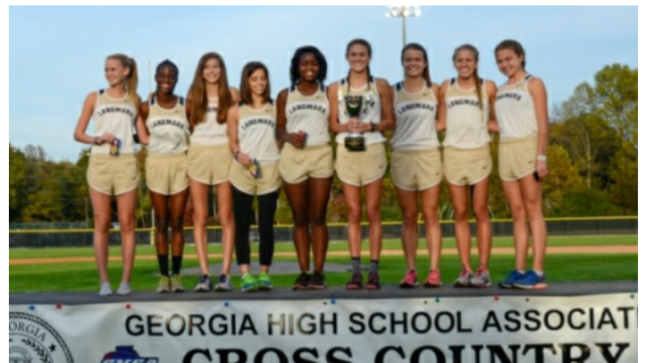
A (private): Landmark Christian War Eagles