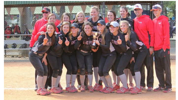
A (public): GMC Bulldogs