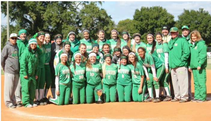
AAAA: Buford Wolves