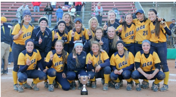
A (private): ELCA Chargers