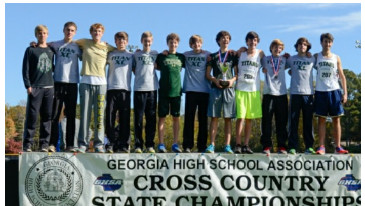
AAA: Blessed Trinity Titans