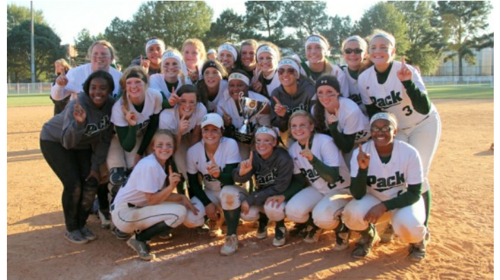
AAAAA: Greenbrier Wolf Pack