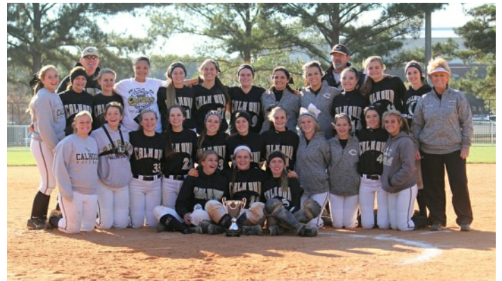
AAA: Calhoun Yellow Jackets