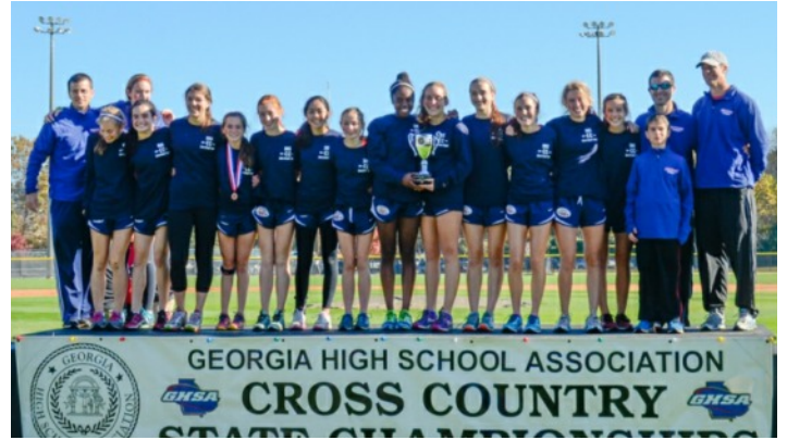
AAAAA: Dunwoody Wildcats