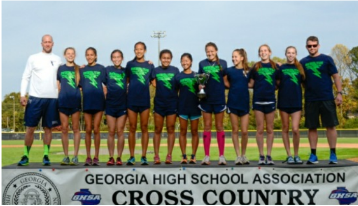
AAAAAA: Northview Titans