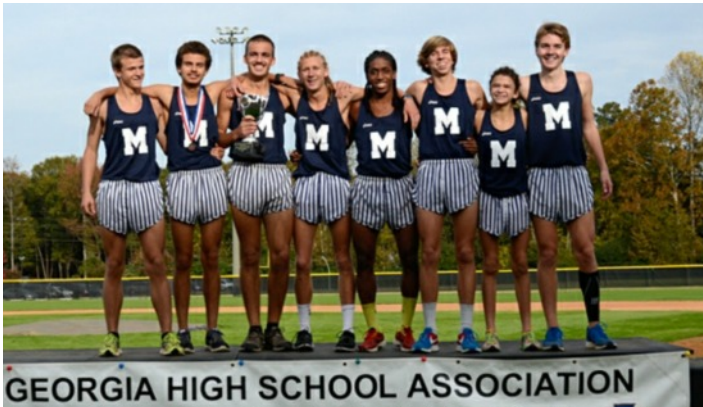
AAAAAA: Marietta Blue Devils