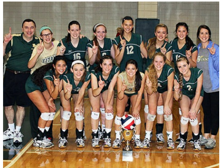
AAA: Blessed Trinity Titans