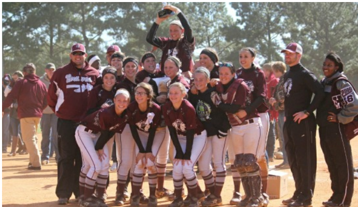
AA: Heard County Braves