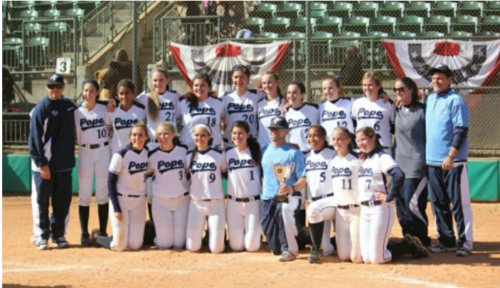
AAAAA: Pope Greyhounds