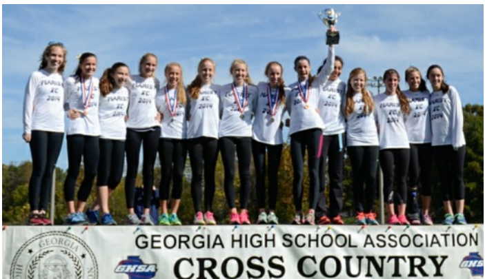
AAAA: Marist War Eagles