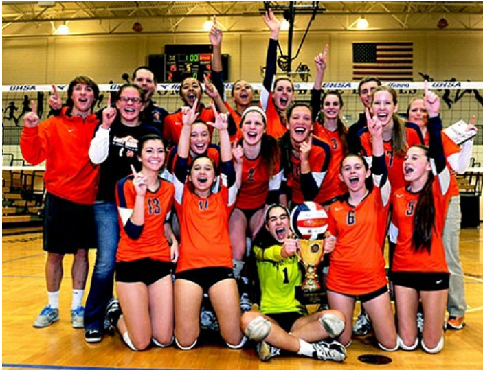
AAAAAA: North Cobb Warriors