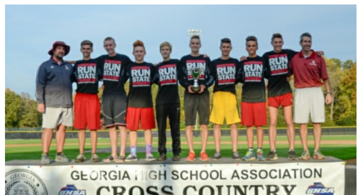
A (private): Hebron Christian Lions