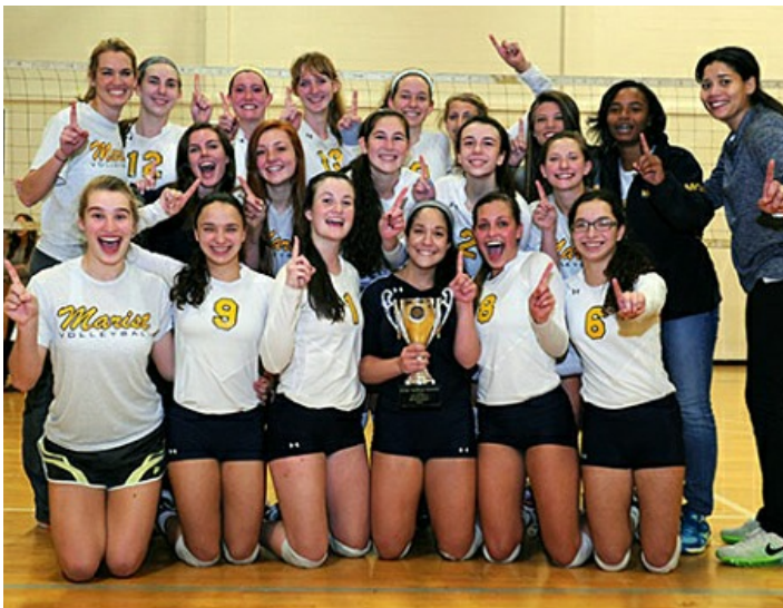
AAAA: Marist War Eagles