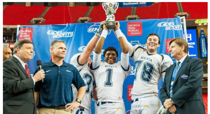
A (private): Eagles Landing Christian