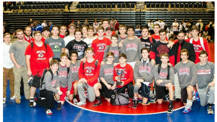
AA: Social Circle