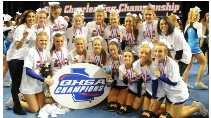
A (private): Mt. Paran