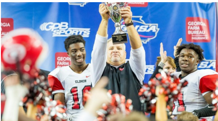
A (public): Clinch County