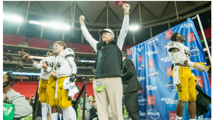
AAAAAA: Colquitt County

Photographs of the state championship Football teams were provided by Cady Studios. Pictures of the winning Cheerleading teams were provided by Georgia Photographics.