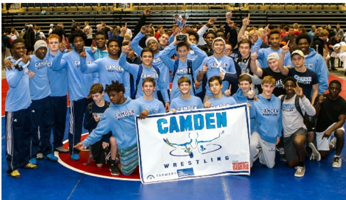
AAAAA: Camden County