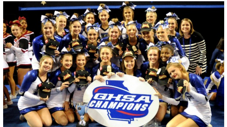
AAA: Pierce County