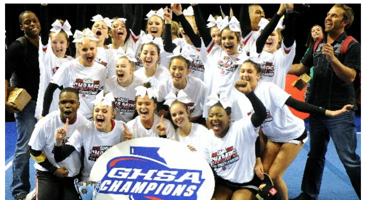
CoEd: Johns Creek