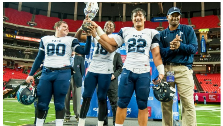
AA: Pace Academy