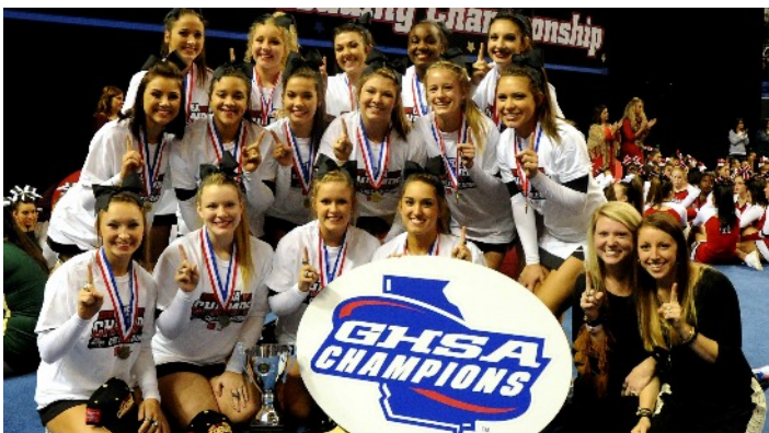
A (public): Commerce