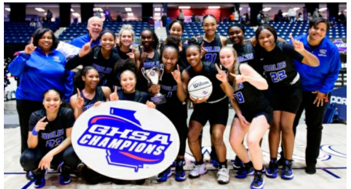
A Private: Mt. Paran