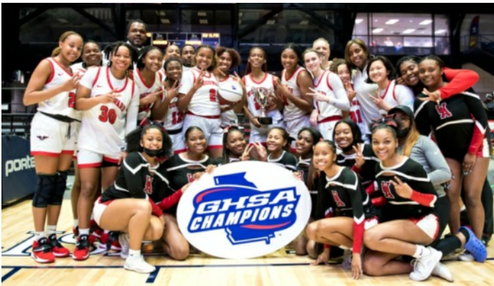
5A: Woodward Academy