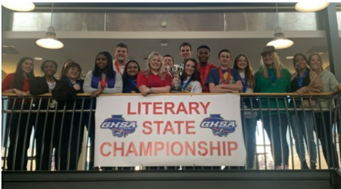
A Public: Georgia Military College