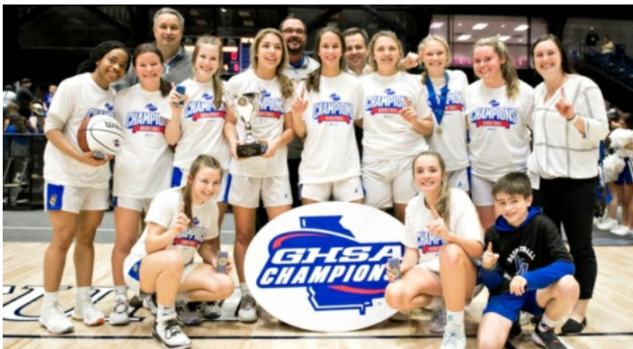
A Public: Lake Oconee Academy