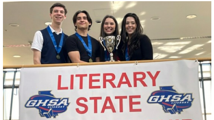
4A: North Oconee