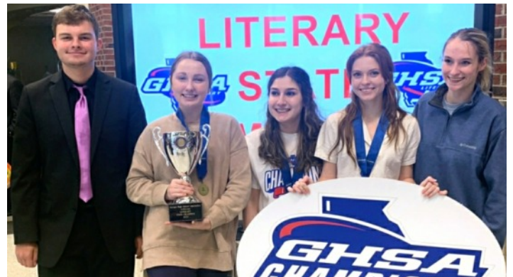
A Private: King's Ridge