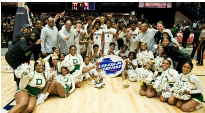
A Public: Drew Charter