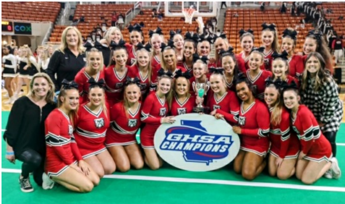
7A: North Gwinnett