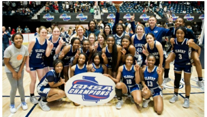
2A: Elbert County