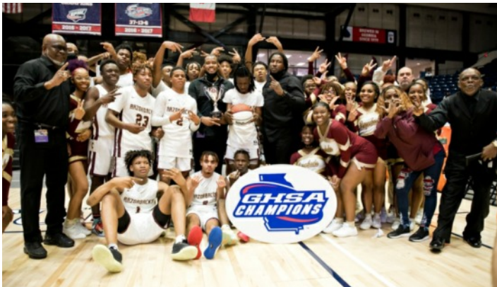
3A: Cross Creek