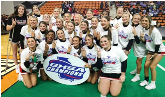
5A-6A: Lee County