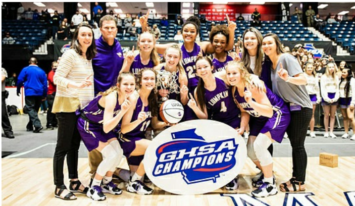
3A: Lumpkin County