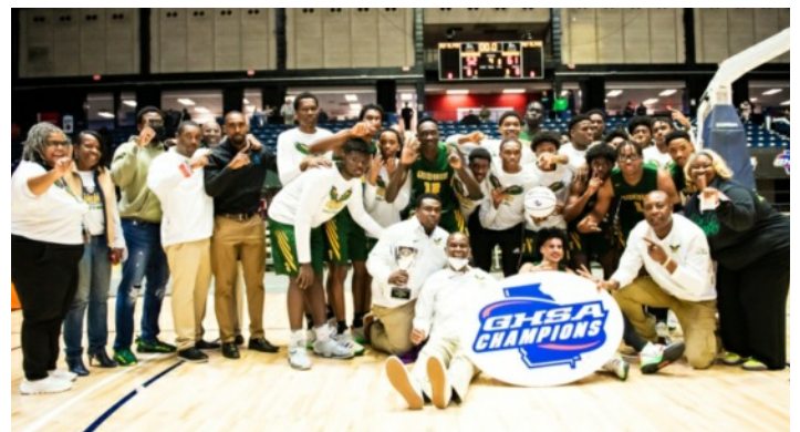
A Private: Greenforest