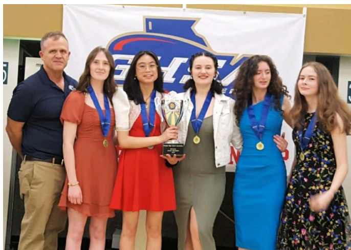
Back-to-Back Team State Champion Camden County