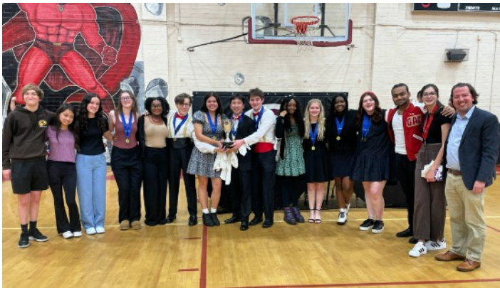
5A: Greater Atlanta Christian