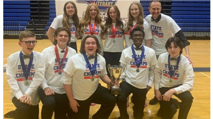
6A: Houston County