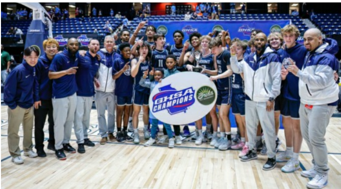
A, Division 1: Mount Vernon