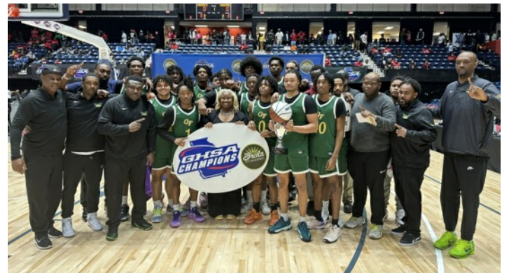
A, Division 2: Greenforest