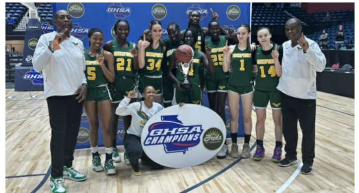
A, Division 2: Greenforest