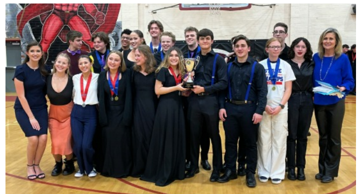
A, Division 1: King's Ridge (tie)