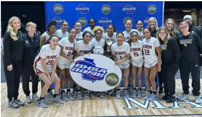
3A: Hebron Christian