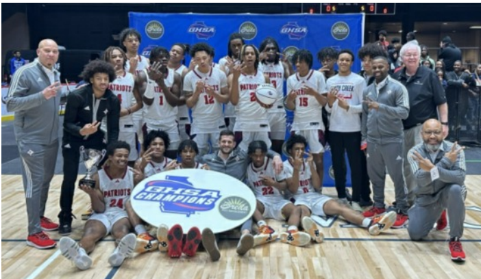
3A: Sandy Creek