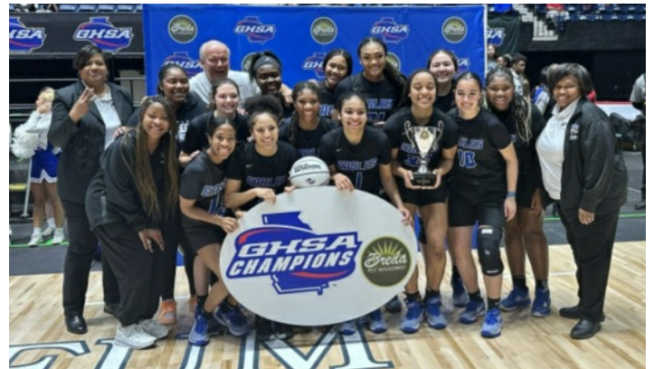
2A: Mount Paran