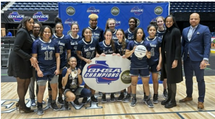
A, Division 1: St. Francis