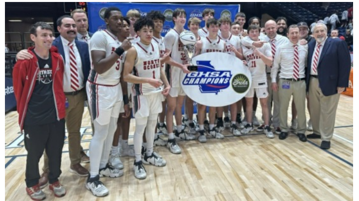
4A: North Oconee