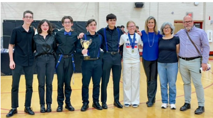
A, Division 1: Bleckley County (tie)