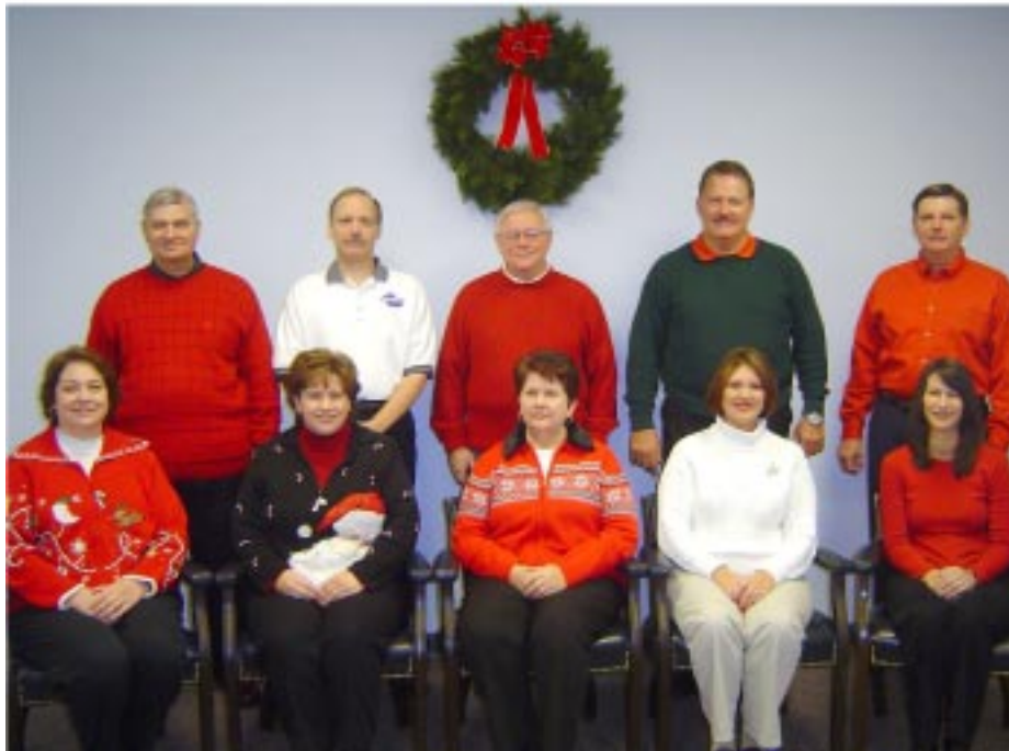
HAPPY HOLIDAYS FROM YOUR GHSA STAFF