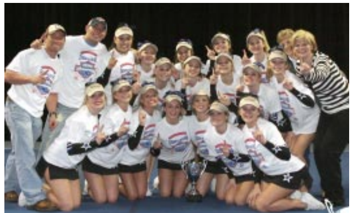
Class A: Bremen