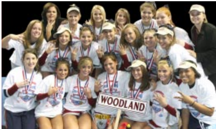
Class AAAA: Woodland