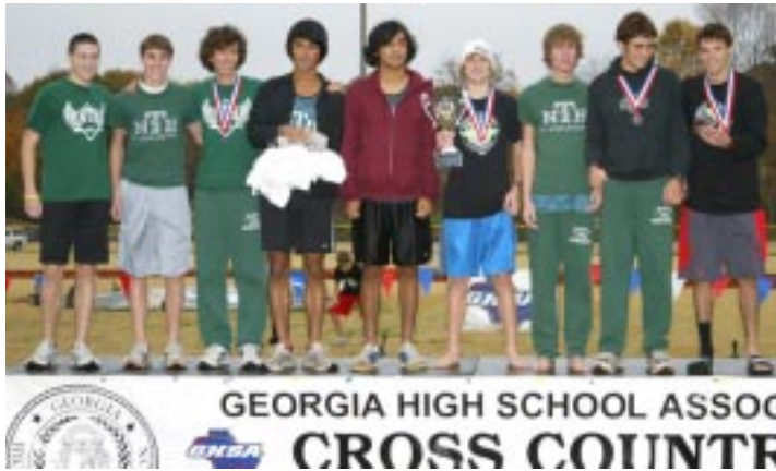
Class AAA Boys: North Hall