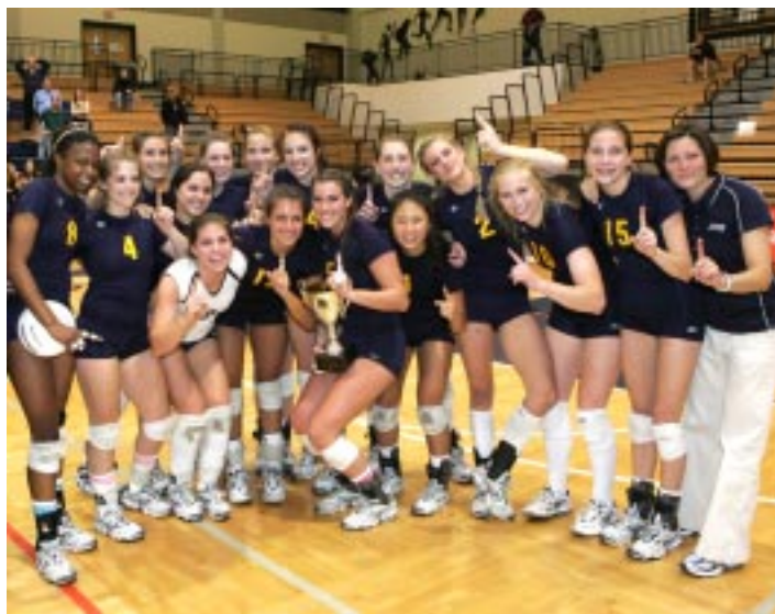
Class AAAA: Marist