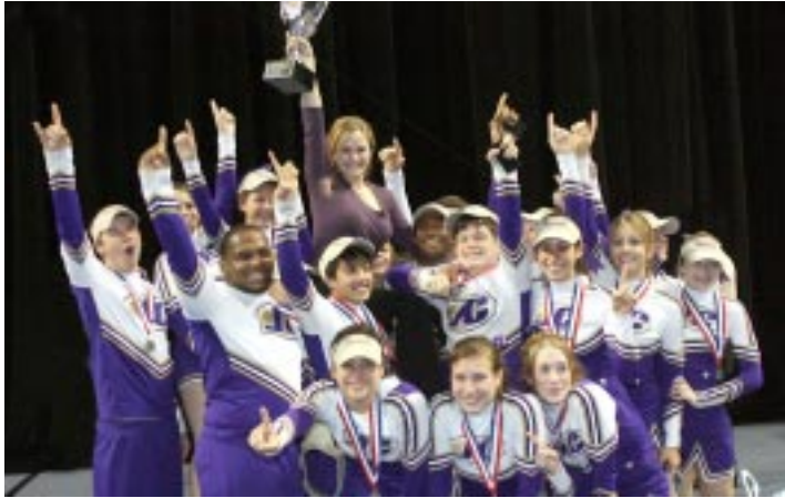
Co-Ed: Jones County