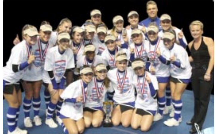
Class AAAAA: Peachtree Ridge