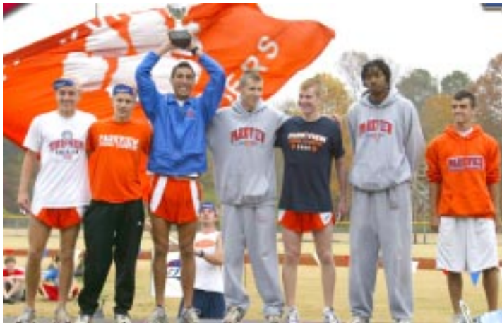
Class AAAAA Boys: Parkview