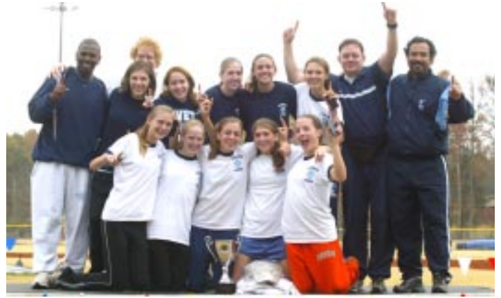
Class AA Girls: Lovett