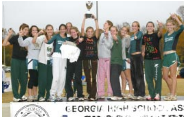
Class AAA Girls: Blessed Trinity