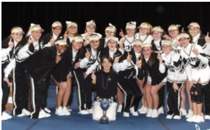
Class AA: Calhoun