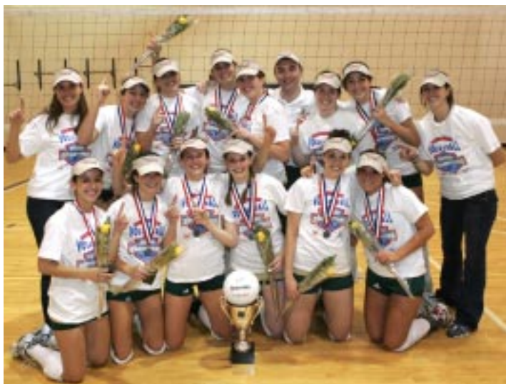
Class AAA: Blessed Trinity