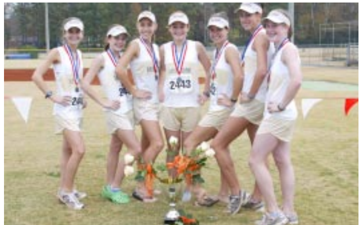
Class A Girls: Landmark Christian