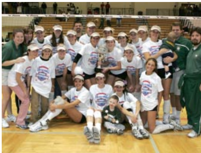
Class AA/A: Wesleyan

Photos on the fall championship pages were provided by Photographic Arts . Other photos taken at the State Finals can be found at schoolpix.biz .