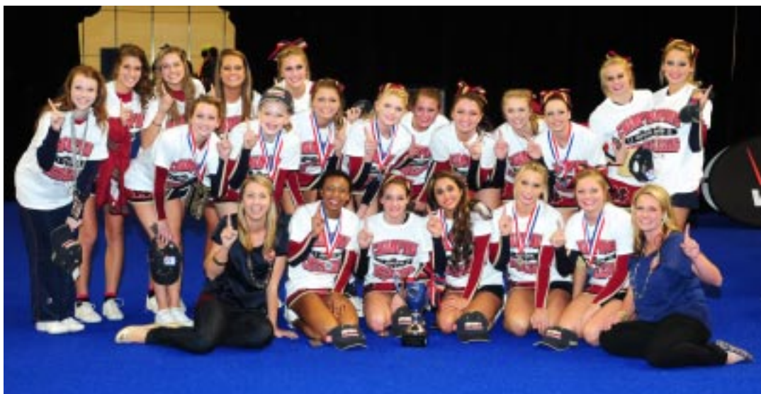
Class AAAAA Mill Creek Lady Hawks