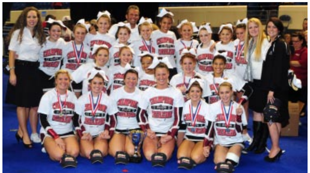
Class AAAA Northgate Lady Vikings