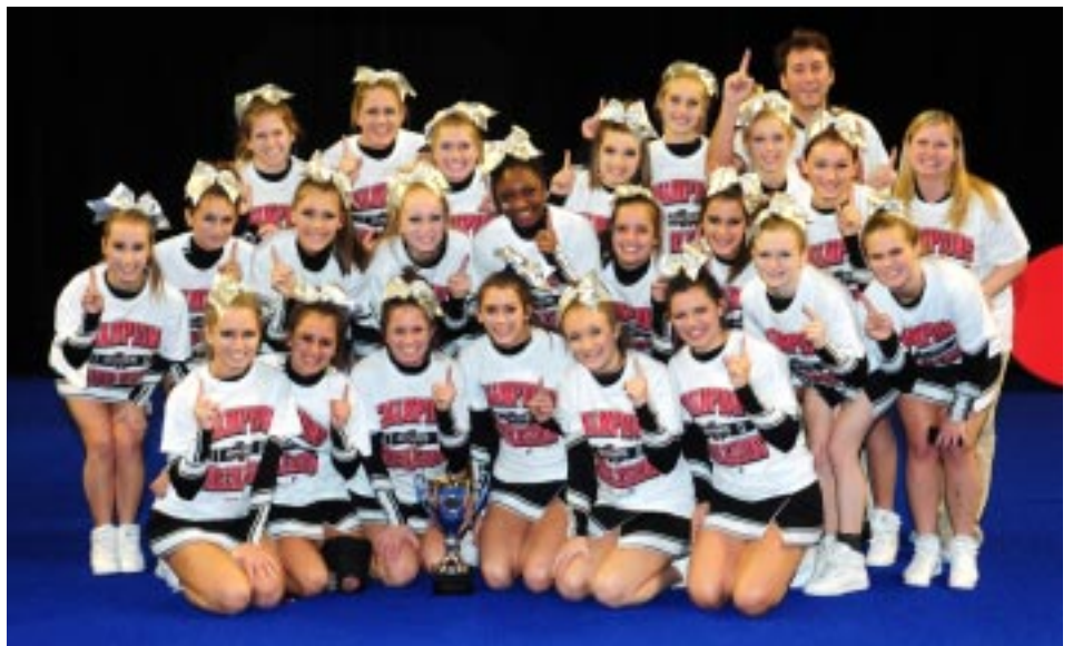
Class A Trion Lady Bulldogs