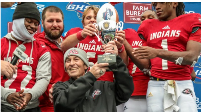
A Public: Irwin County