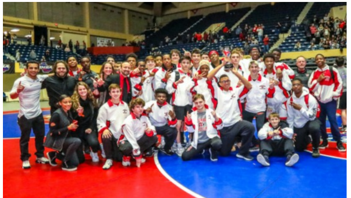
4A: Woodward Academy