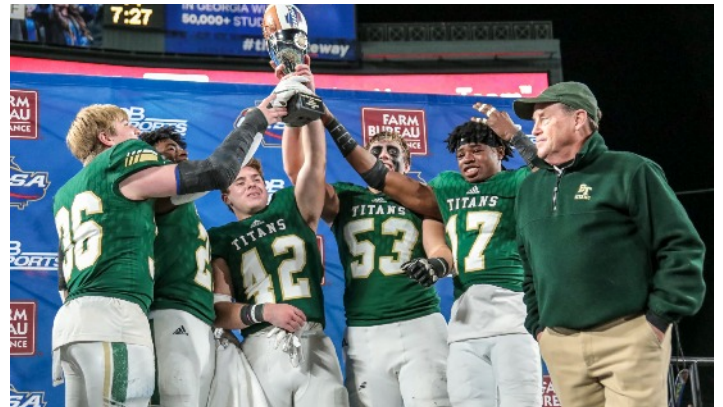
4A: Blessed Trinity