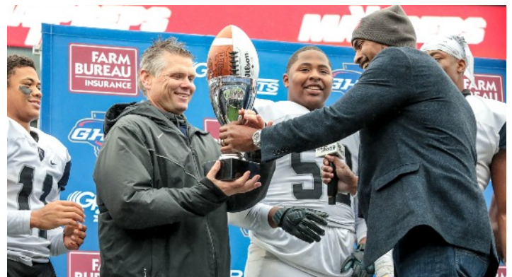
A Private: ELCA