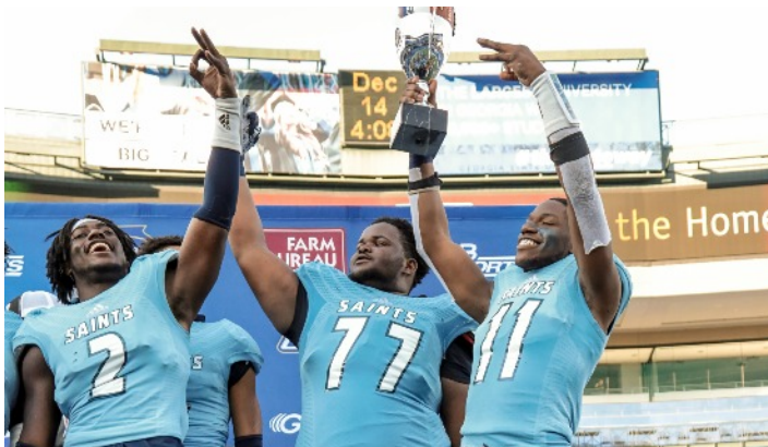
3A: Cedar Grove