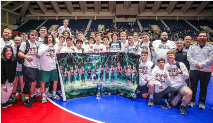
3A: North Hall