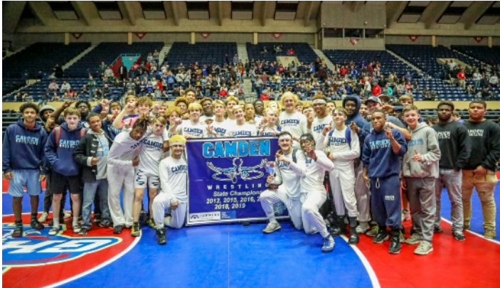
7A: Camden County