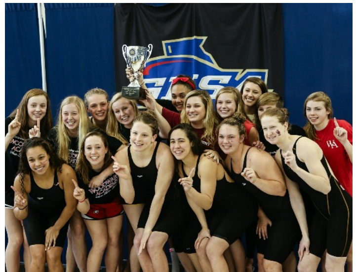
Class A-AAAAA Champion: Woodward