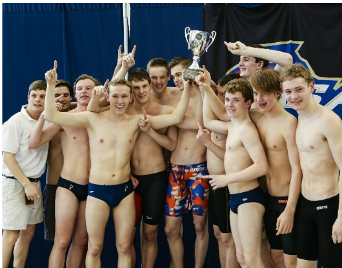
Class A-AAAAA Boys Champion: St. Pius