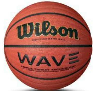
WAVE* SOLUTION* GAME BALL