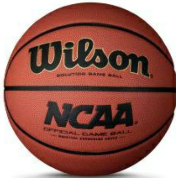
NCAA* GAME BALL