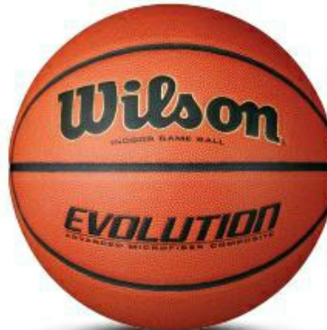
EVOLUTION* GAME BALL