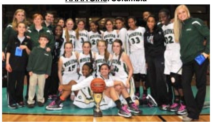
AA Girls: Wesleyan