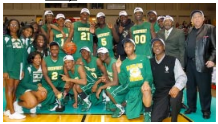
A (Private) Boys: Greenforest Christian