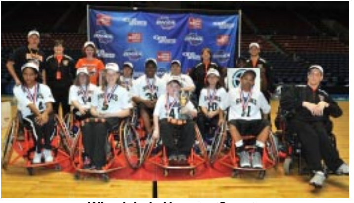
Wheelchair: Houston County