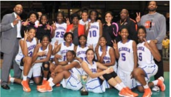
AAAA Girls: Columbia