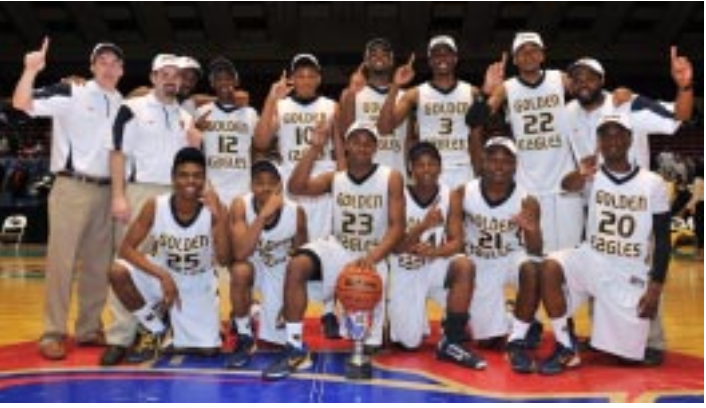
AAAA Boys: Eagle's Landing