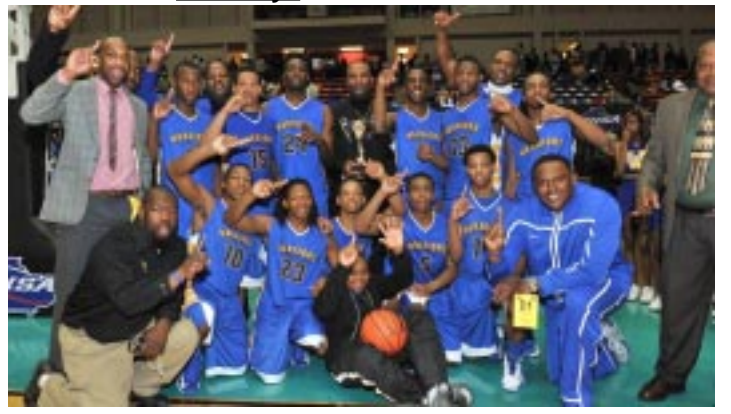
A (Public) Boys: Wilkinson County