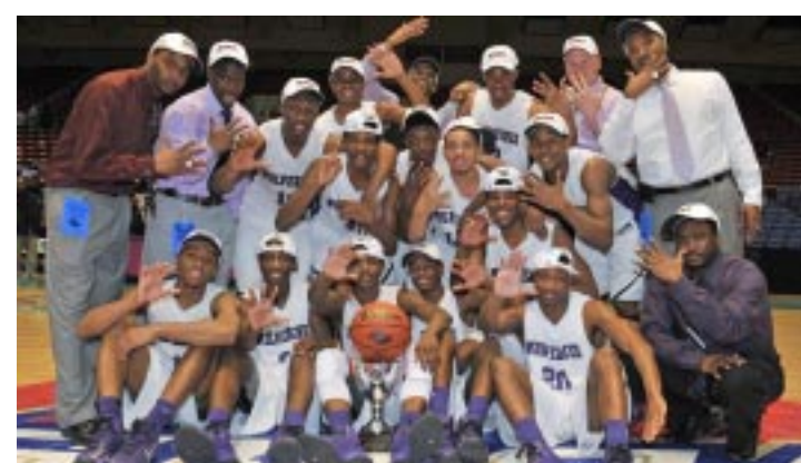
AAAAA Boys: Miller Grove