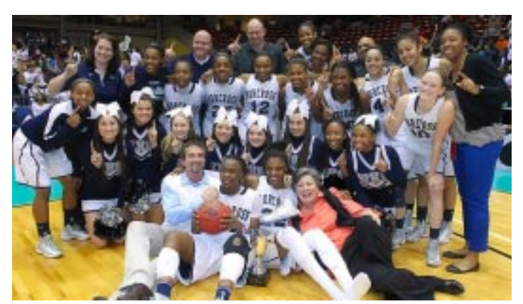
AAAAAA Girls: Norcross