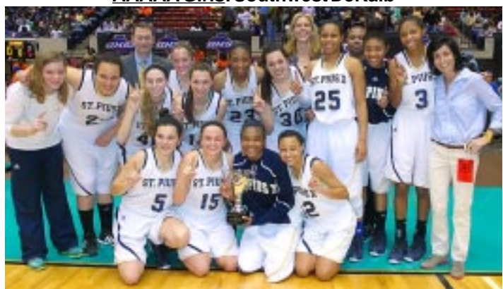
AAA Girls: St. Pius