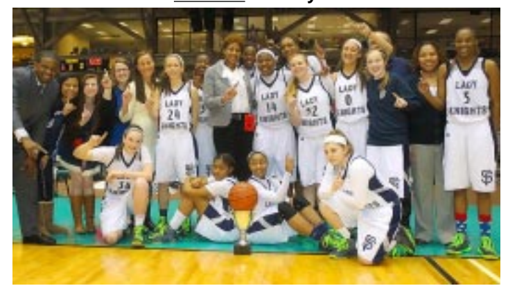
A (Private) Girls: St. Francis