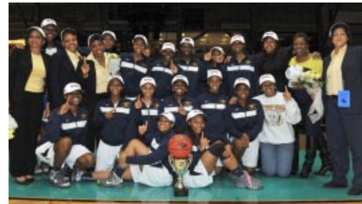
AAAAA Girls: Southwest DeKalb