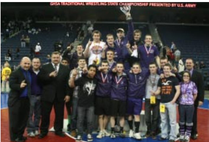
Class AAA Champion: Gilmer

Photos of the championship teams represented in this newsletter were provided by Photographic Arts . Other photos from the various GHSA state events can be found at www.schoolpix.biz .