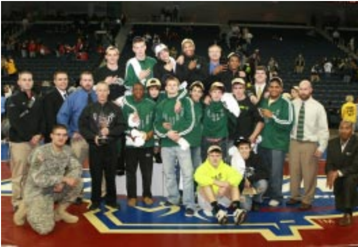
Class AAAAA Champion: Collins Hill