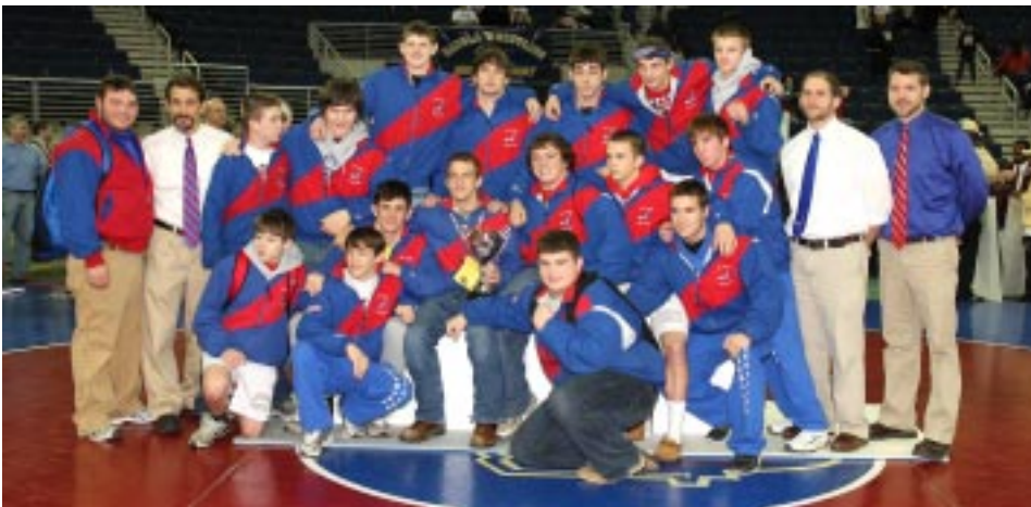
Class AA Champion: Jefferson