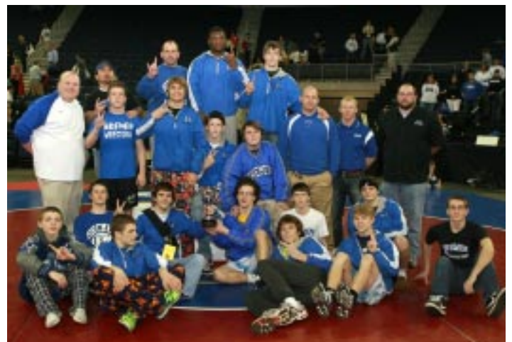
Class A Champion: Bremen