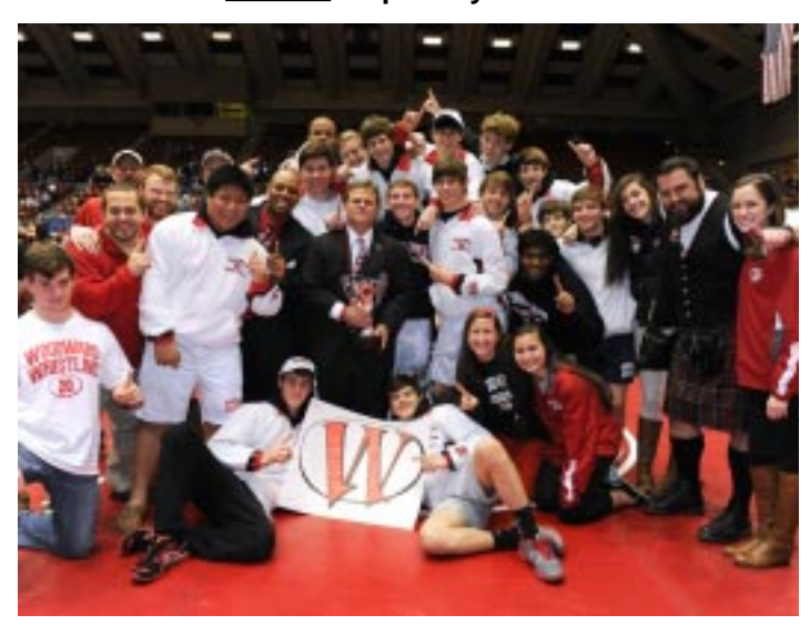
AAA: Woodward Academy War Eagles