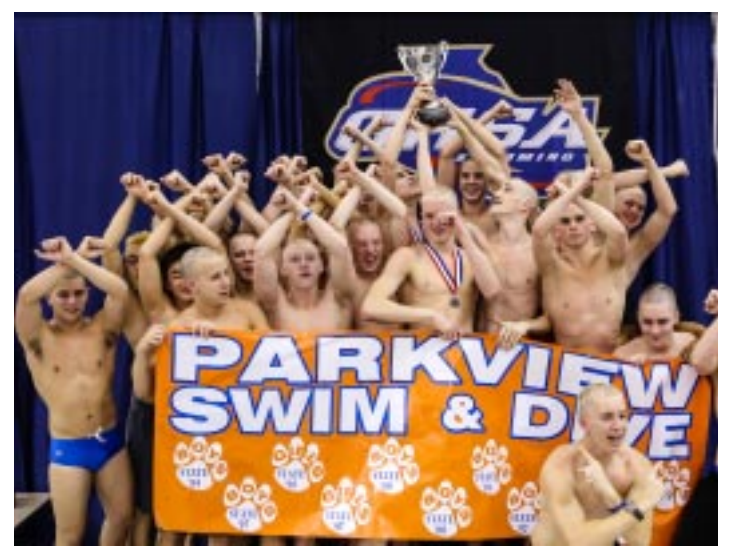
Class AAAAA Boys Champion: Parkview