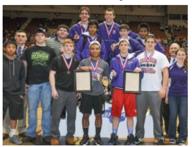
AAAA : Gilmer Bobcats