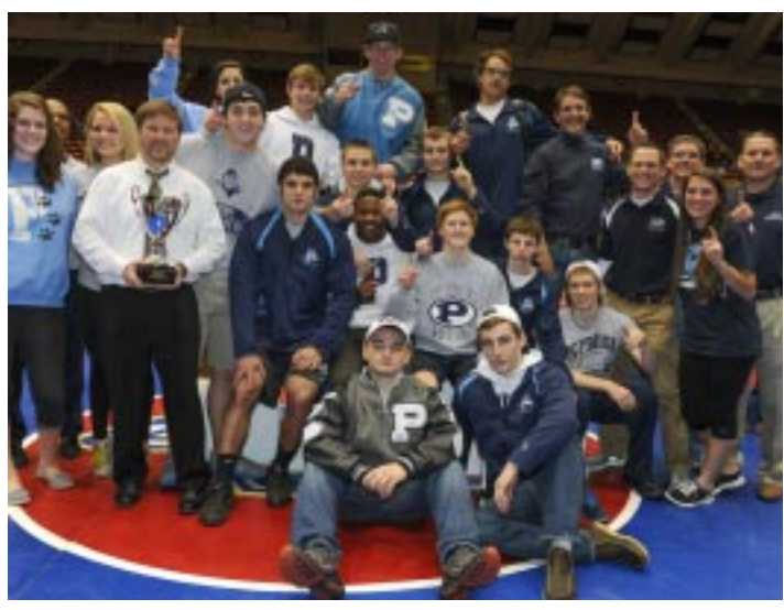
AAAA : Pope Greyhounds