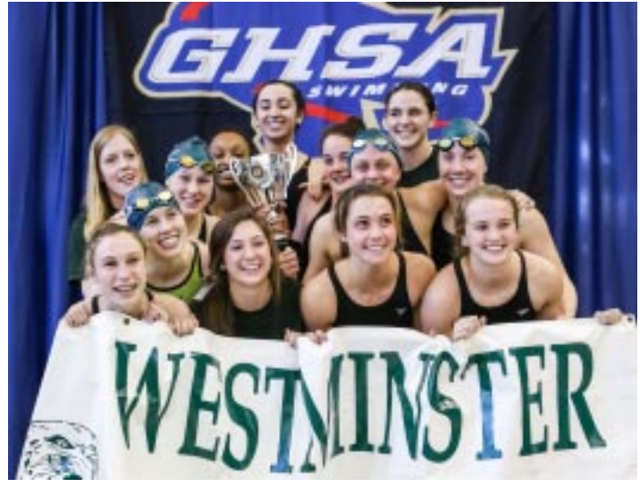
Class A-AAAAA Girls Champion: Westminster

Photographs of the state championship Swimming teams were provided by River Oak Photography . Action photos from swimming may be found at RiverOakPhotography.com . Photos of the State Traditional Wrestling champions on the next page were provided by Georgia Photographics . Action photos from wrestling may be found and purchased at GHSAphotos.com .