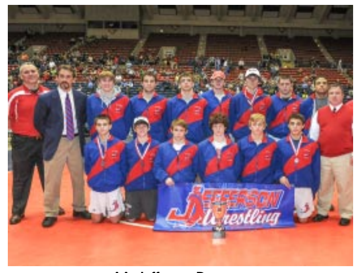
AA : Jefferson Dragons