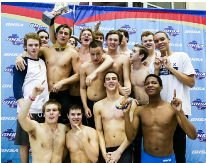
Class A-5A Boys Champion: St. Pius