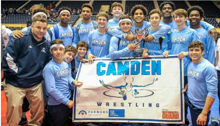
7A: Camden County