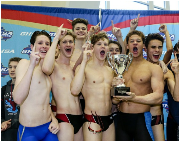
Class 6A-7A Boys Champion: Brookwood