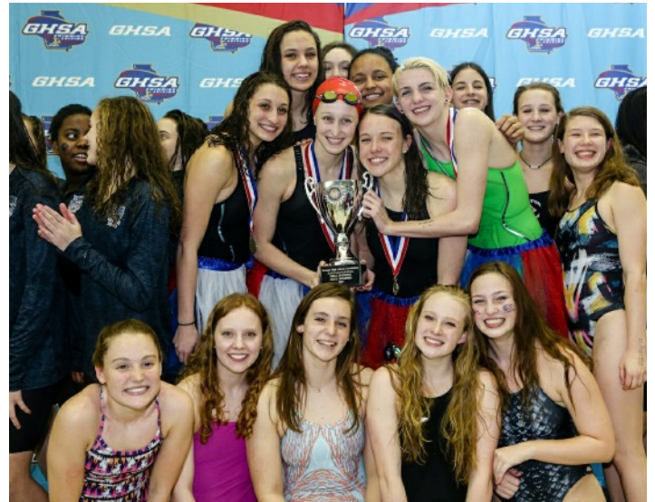
Class 6A-7A Girls Champion: Walton