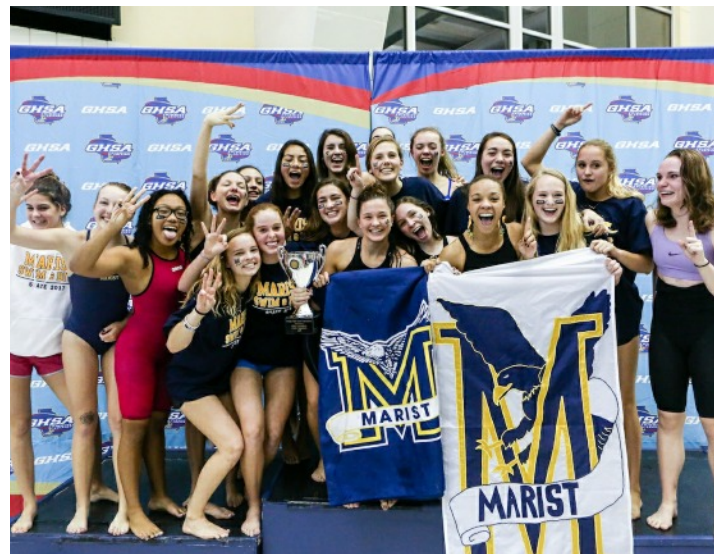
Class A-5A Girls Champion: Marist