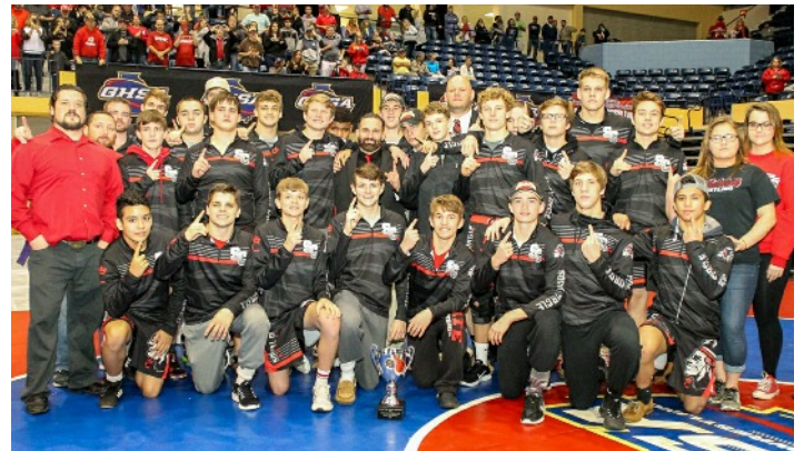
2A: Social Circle