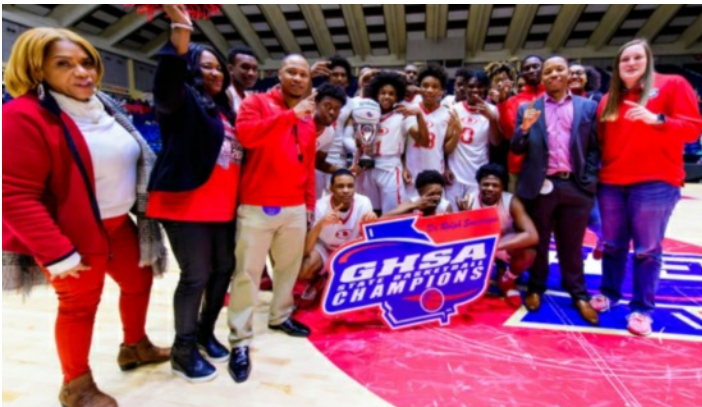
5A Boys: Dutchtown