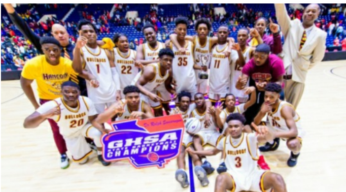
A Public Boys: Hancock Central