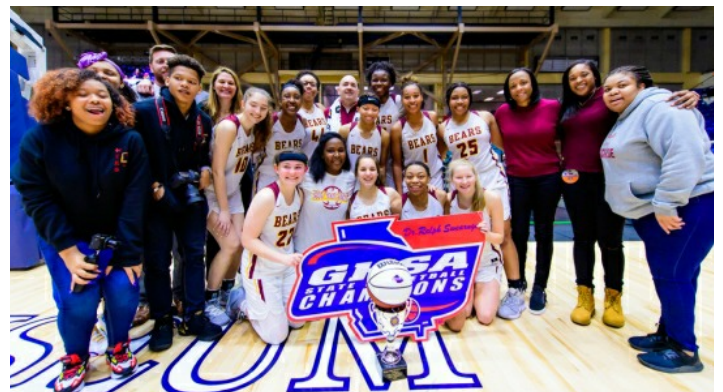
A Private Girls: Holy Innocents'