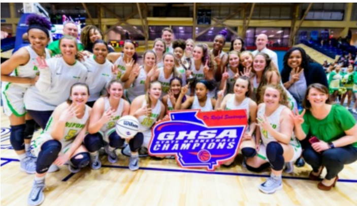
5A Girls: Buford