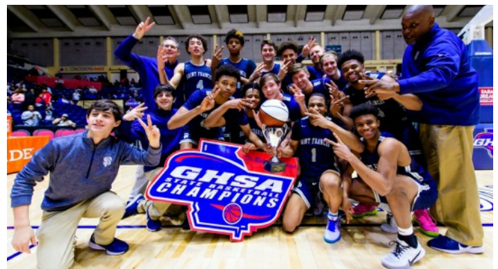
A Private Boys: St. Francis