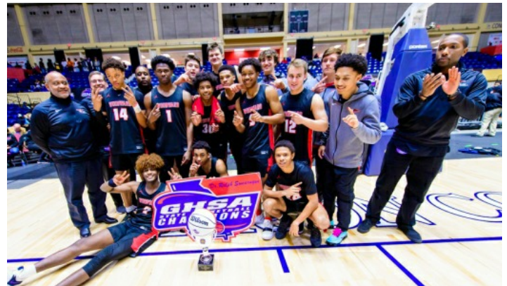
4A Boys: Woodward