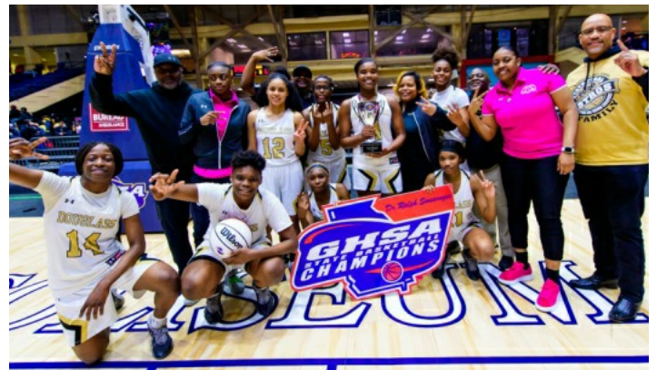
2A Girls: Douglass-Atlanta