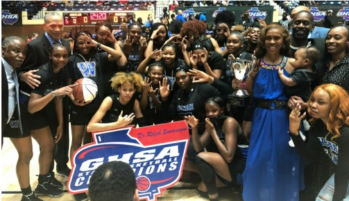
7A Girls: Westlake