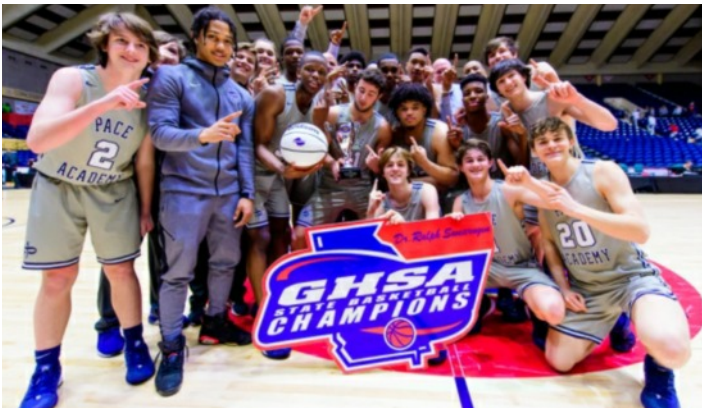
3A Boys: Pace Academy