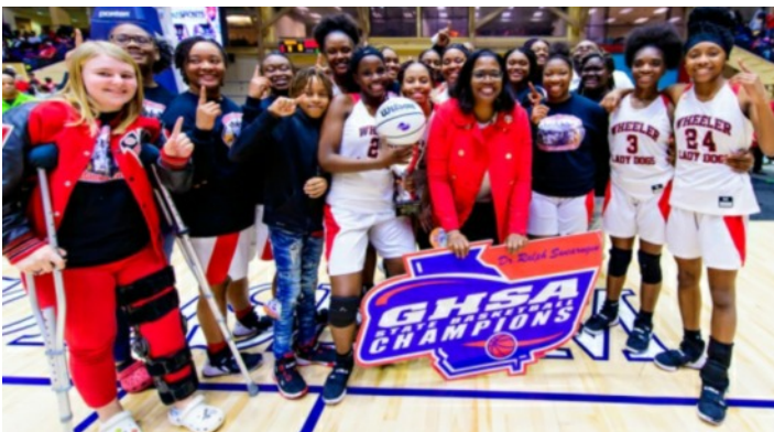
A Public Girls: Wheeler County