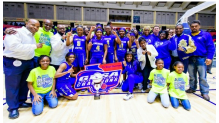
4A Girls: Americus-Sumter