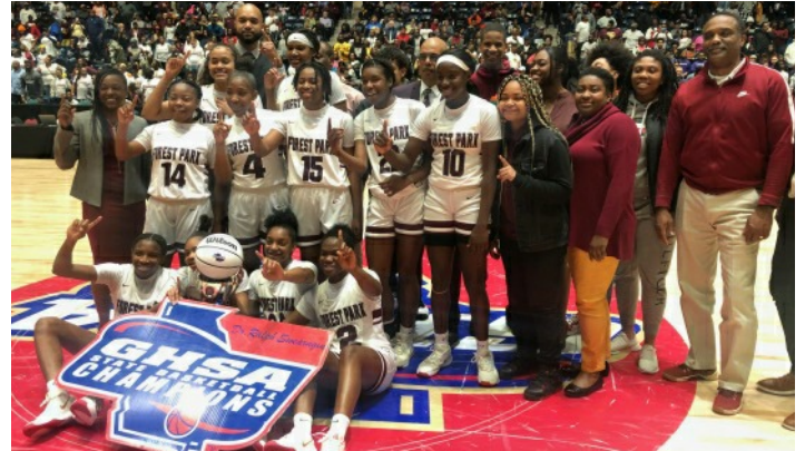
6A Girls: Forest Park