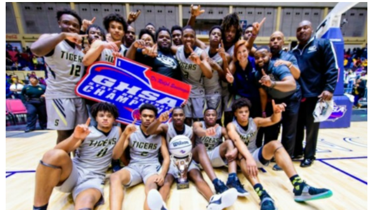
2A Boys: Swainsboro