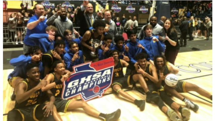
6A Boys: Chattahoochee