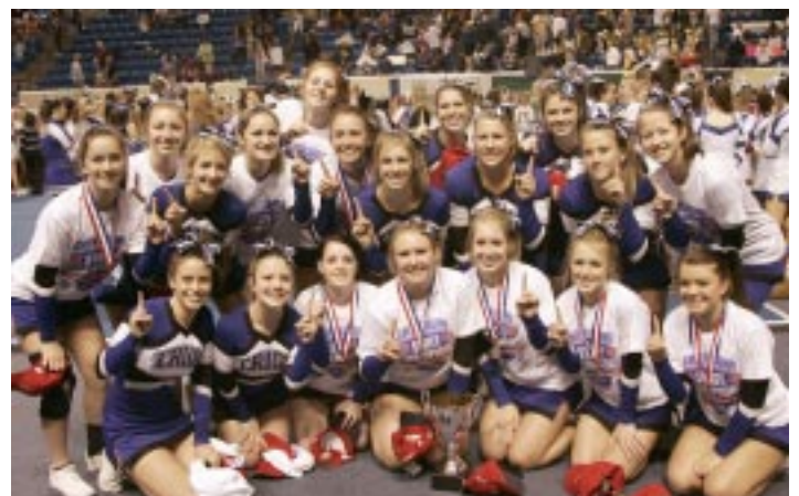
Class A: Trion