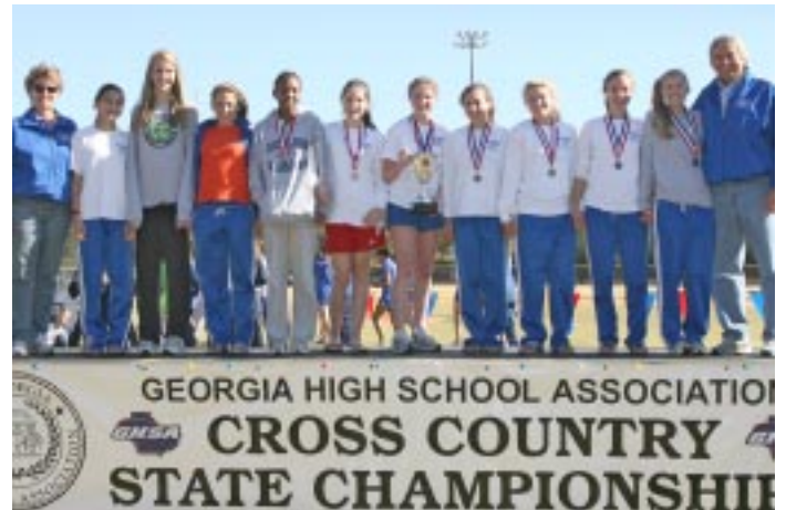
Class AAA Girls: Columbus