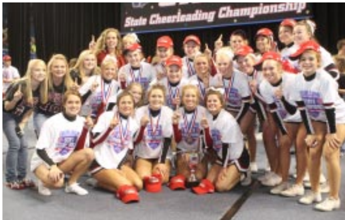
Class AAAA: Northgate