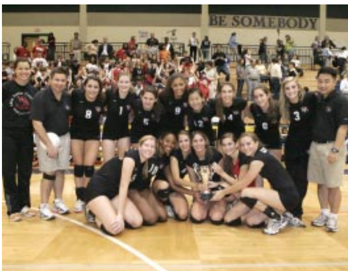
Class AAA: Woodward