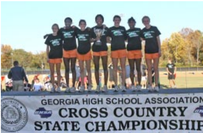
Class AAAAA Girls: Collins Hill