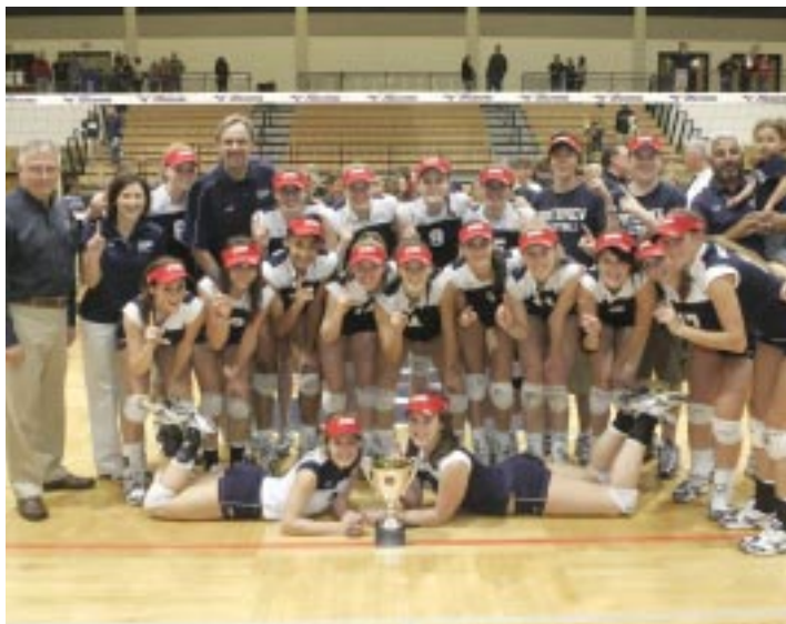
Class AAAAA: Northview