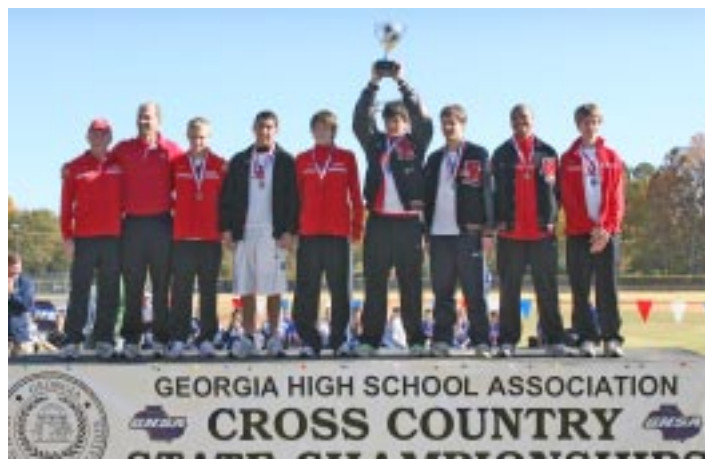
Class AAA Boys: Flowery Branch