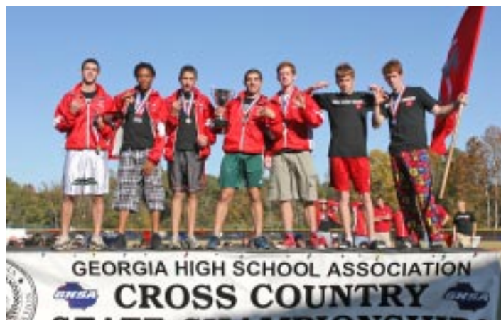
Class A Boys: Our Lady of Mercy