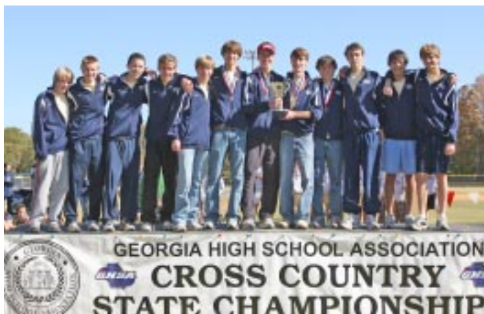
Class AAAA Boys: Marist