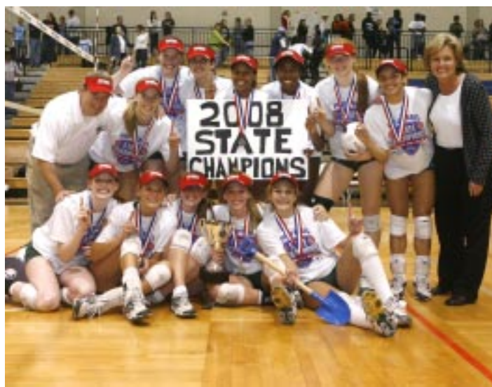
Class AA/A: Westminster

Photos of the championship teams represented in this newsletter were provided by Photographic Arts . Other photos from the various GHSA state events can be found at www.schoolpix.biz .