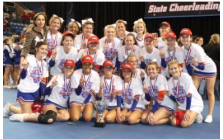
Class AAA: Columbus