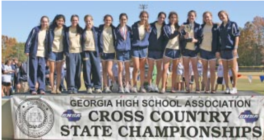
Class AAAA Girls: Marist