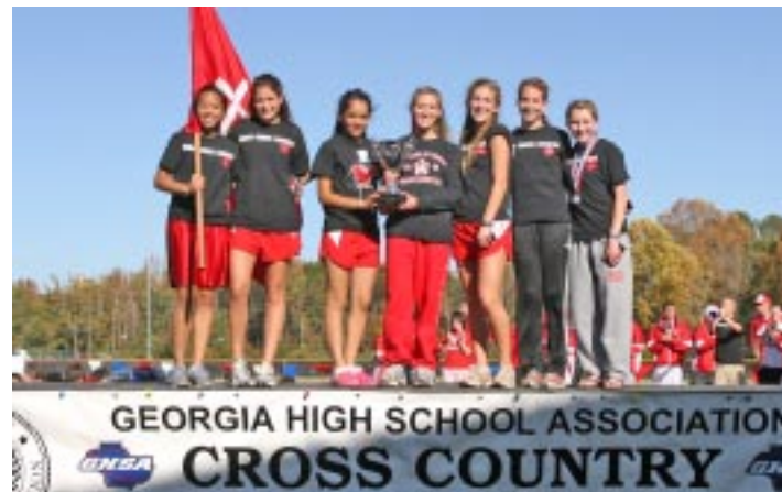
Class A Girls: Our Lady of Mercy