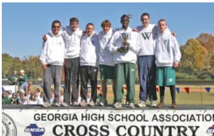
Class AA Boys: Westminster