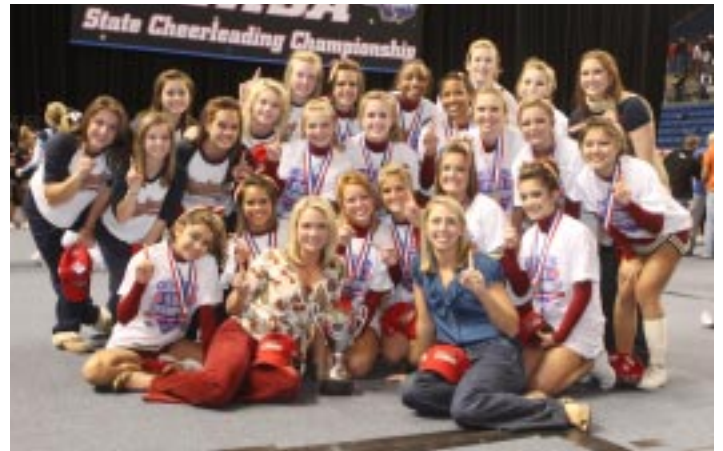
Class AAAAA: Mill Creek