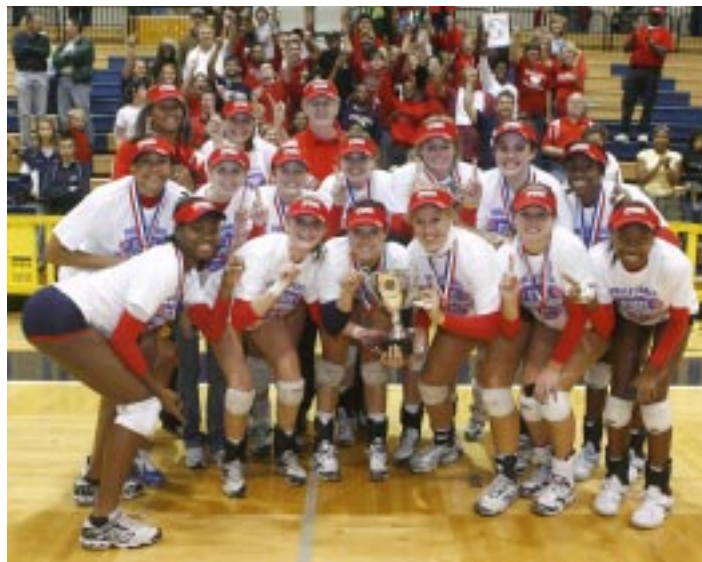
Class AAAA: Sandy Creek