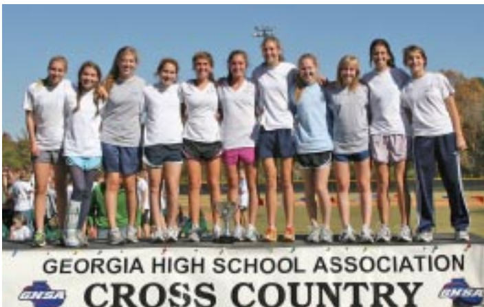
Class AA Girls: Lovett