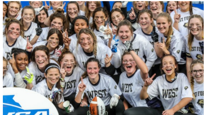
6A-7A: West Forsyth

Congratulations to the first ever GHSA Flag Football State Champions, West Forsyth and Calvary Day. Photos of the other Football champions may be found on the next page.