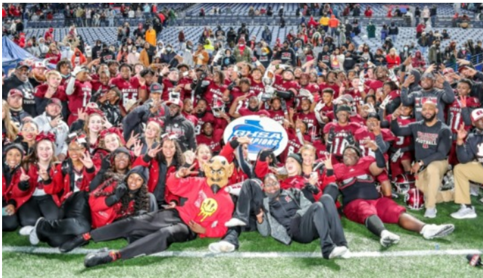
5A: Warner Robins