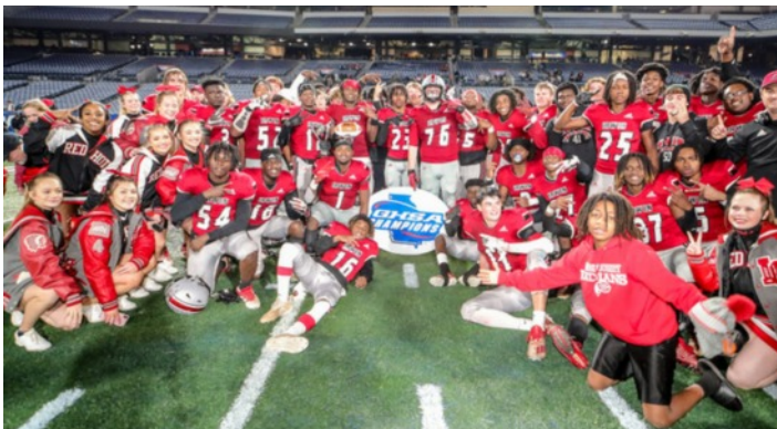
A Public: Irwin County