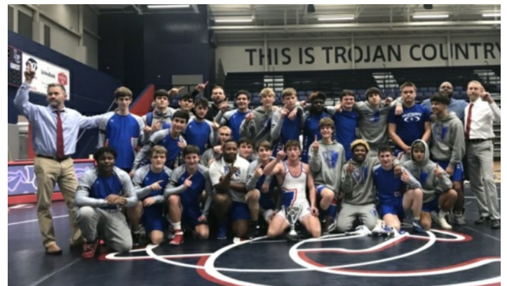
2A: Oglethorpe County