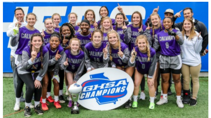
A-5A: Calvary Day