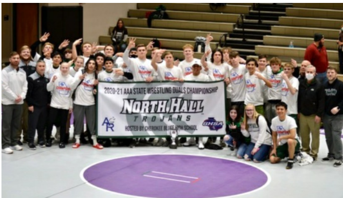
3A: North Hall