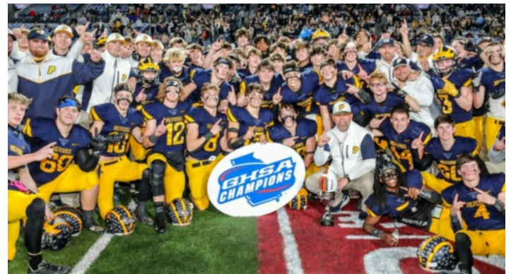
A Private: Prince Avenue