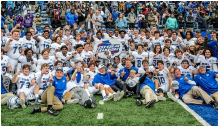
3A: Pierce County