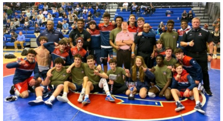
A: Mount Pisgah