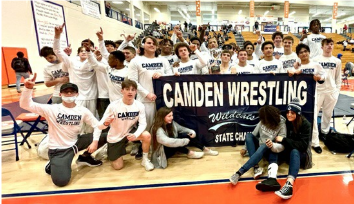
7A: Camden County