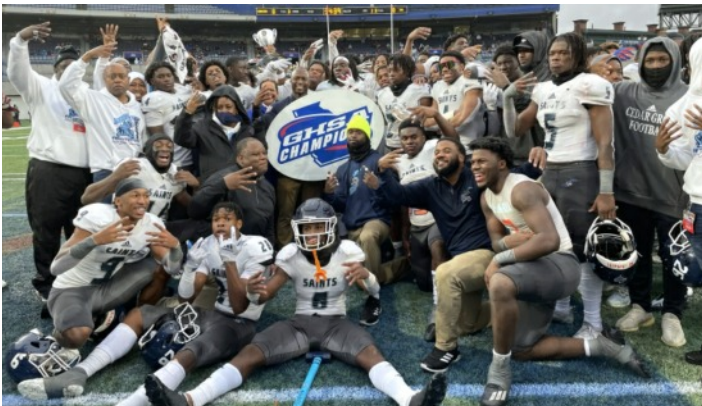
3A: Cedar Grove