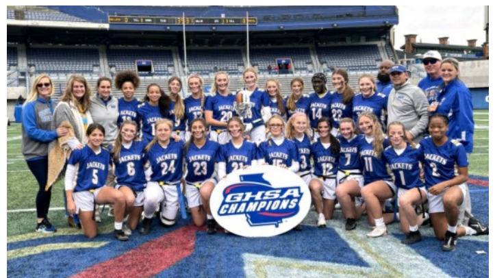
A-4A: Southeast Bulloch