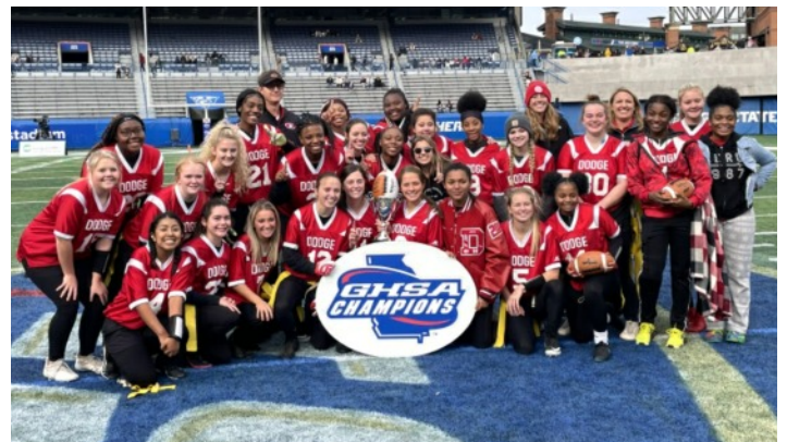
5A-6A: Dodge County