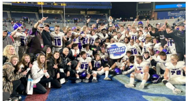
A Private: Trinity Christian