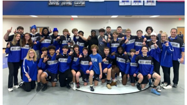
4A: West Laurens