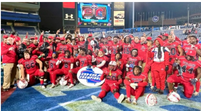
A Public: Brooks County