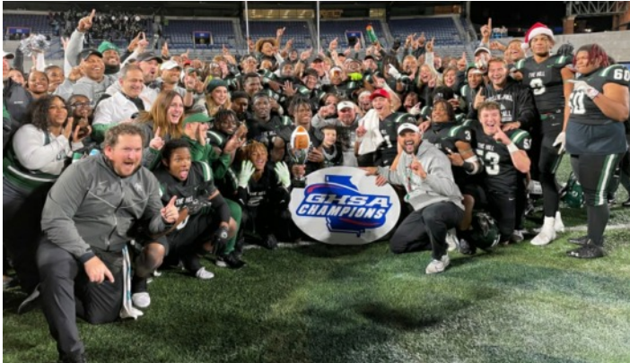
7A: Collins Hill