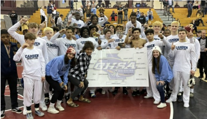
7A: Camden County