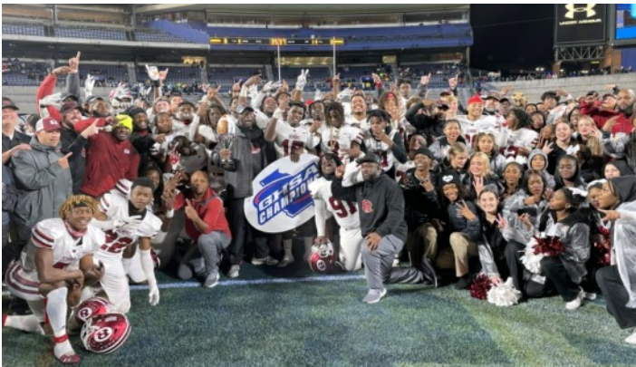
5A: Warner Robins