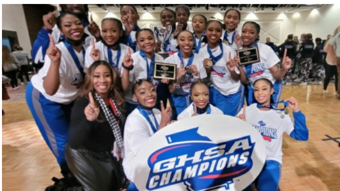
A-2A: Stilwell Arts