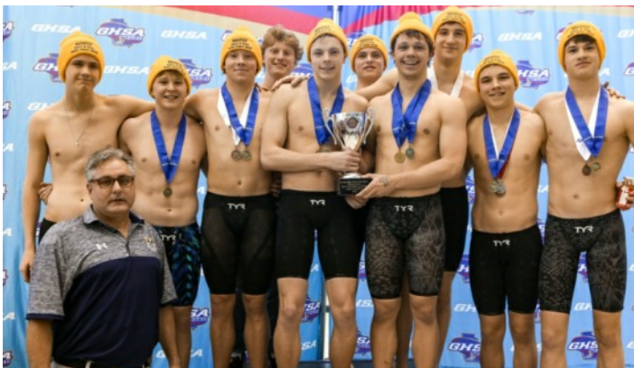
4A-5A Boys: Marist