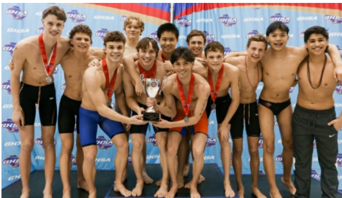
6A Boys: Johns Creek