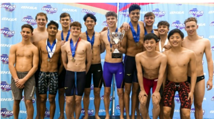
A-3A Boys: Westminster