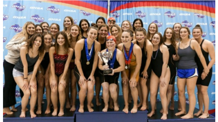
7A Girls: Walton