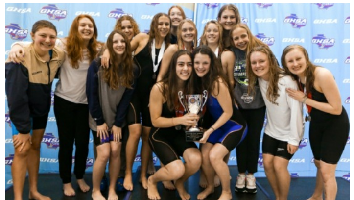
4A-5A Girls: St. Pius