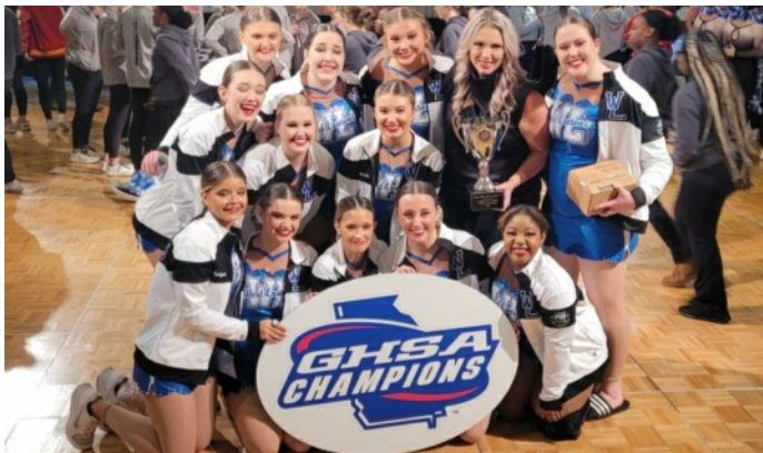
3A-4A: West Laurens