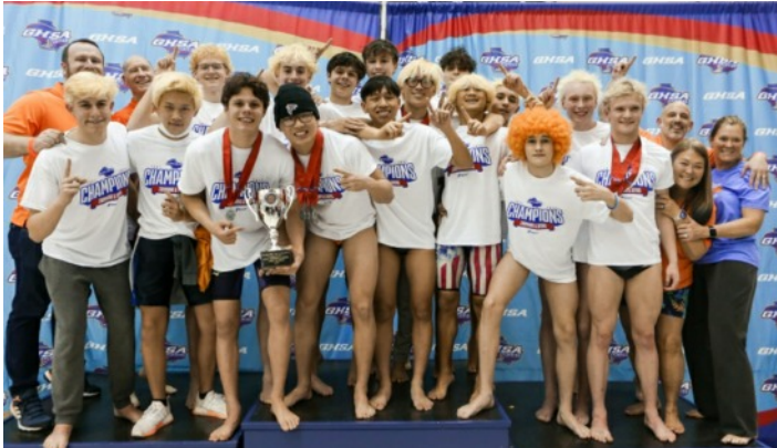
7A Boys: Parkview