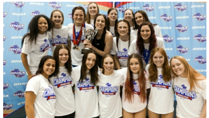
6A Girls: Lassiter