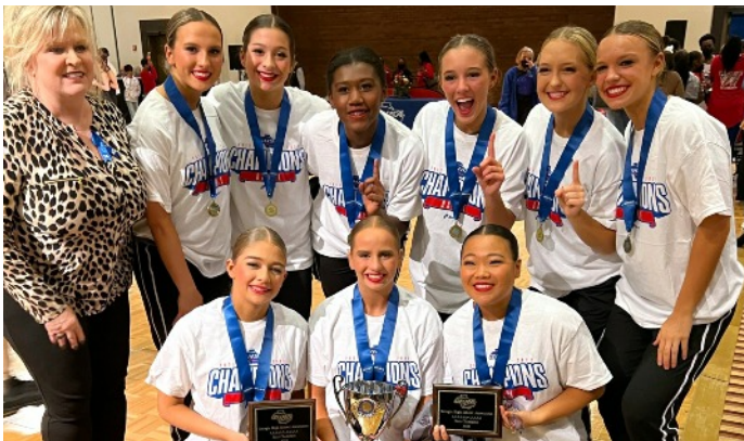
5A-6A: Starr's Mill