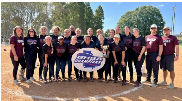
A, Division 1: Heard County