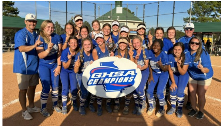
4A: West Laurens