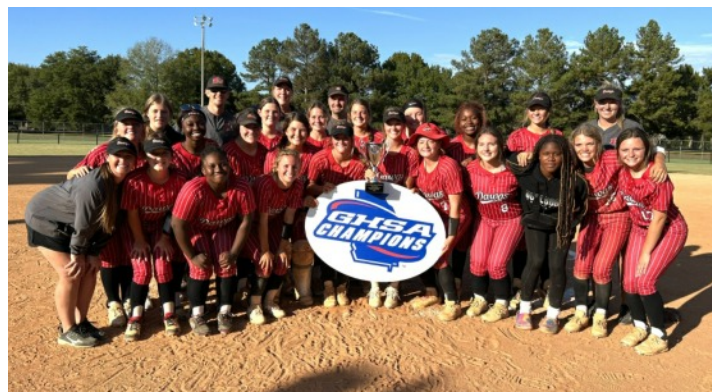
A, Division 2: Emanuel County Institute