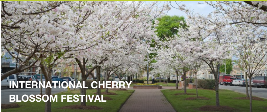
INTERNATIONAL CHERRY BLOSSOM FESTIVAL