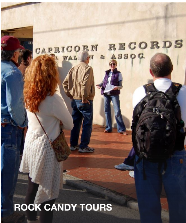
ROCK CANDY TOURS