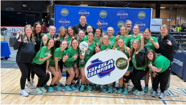
2A Girls - Murray County