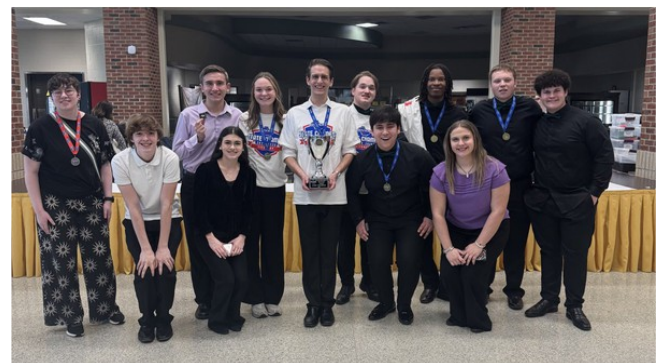
6A - Buford