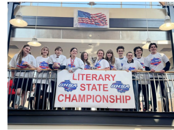
2A - Holy Innocents'