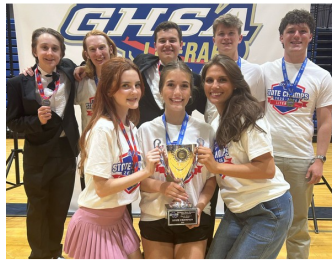
A-Div I - Bremen