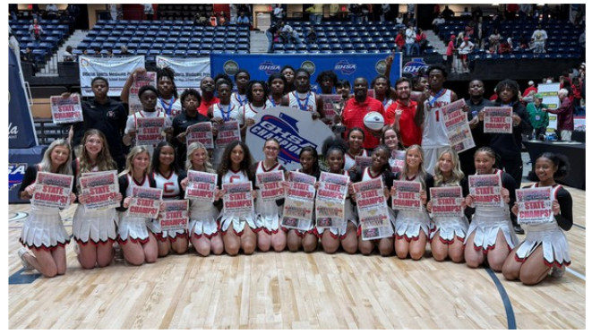
A Division 2 Boys - Clinch County