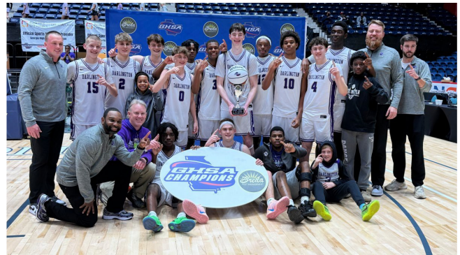
Private Boys - Darlington