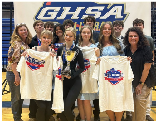
3A - Calhoun