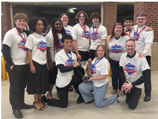
5A - Houston County