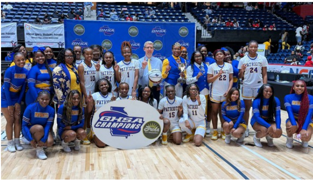
A Division 2 Girls - Wilcox County