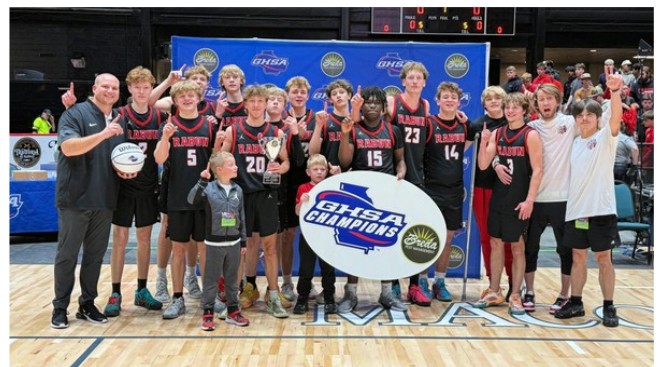
A Division I Boys - Rabun County