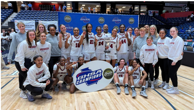
Private Girls - Hebron Christian