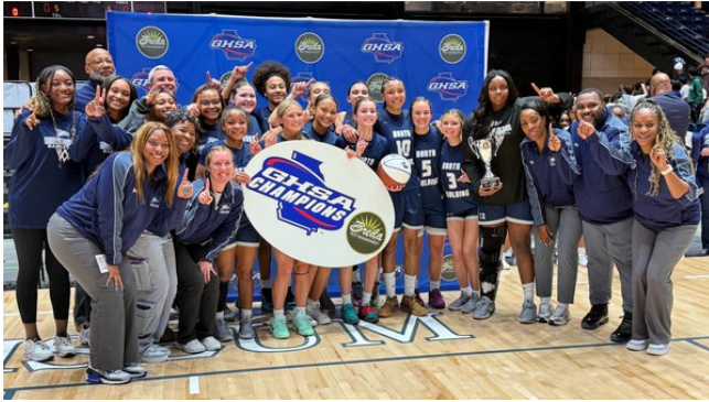
6A Girls - North Paulding