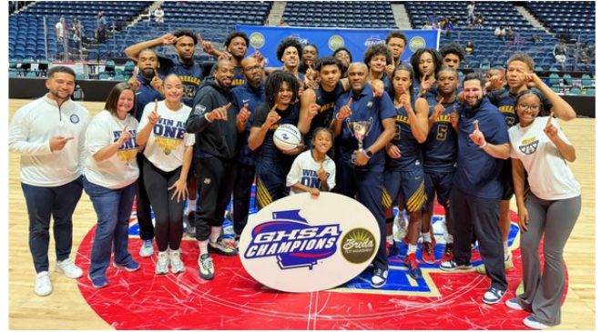
6A Boys - Wheeler