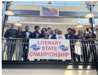
A-Div II - Stilwell Arts