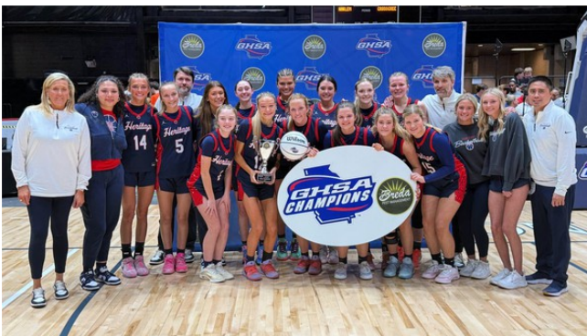
3A Girls - Heritage, Catoosa