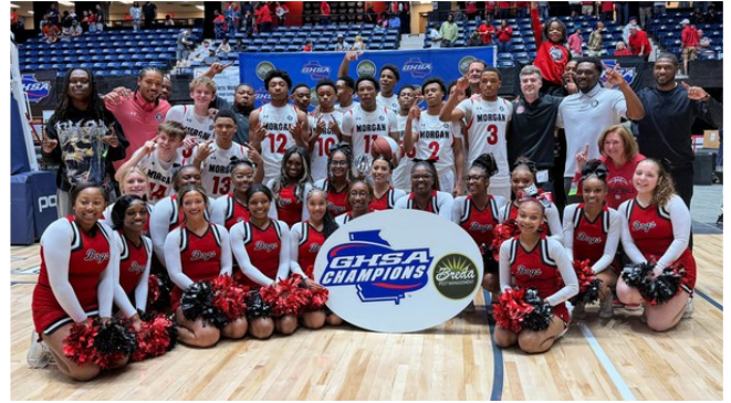
2A Boys - Morgan County