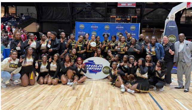
A Division I Girls - East Laurens