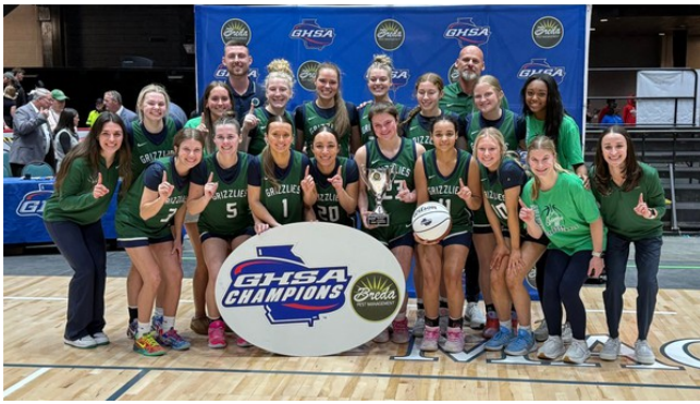
5A Girls - Creekview