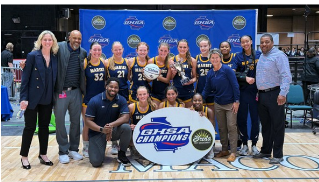
4A Girls - Marist