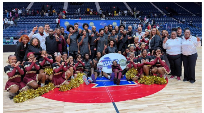
3A Boys - Cross Creek