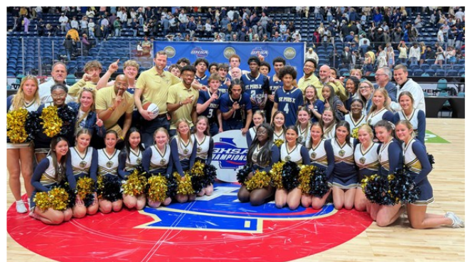
4A Boys - St. Pius X