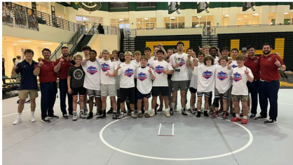
4A - Woodland, Cartersville