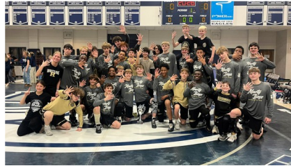
2A - Rockmart