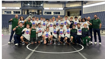
5A - Creekview