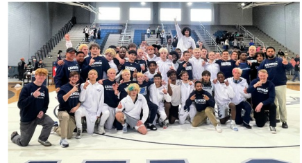
6A - Camden County