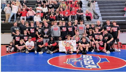
1A - Social Circle

Watch matches on NFHS Network free on demand three days after the event. Digital downloads available to order at NFHS Network .