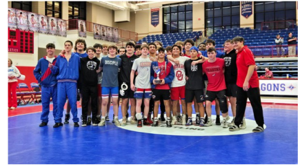
3A - Jefferson