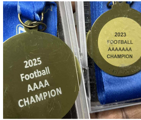
On the Flip Side (New vs Retired)

https://www.ghsa.net/sites/default/files/documents/forms/MedalOrderForm2025v2.pdf