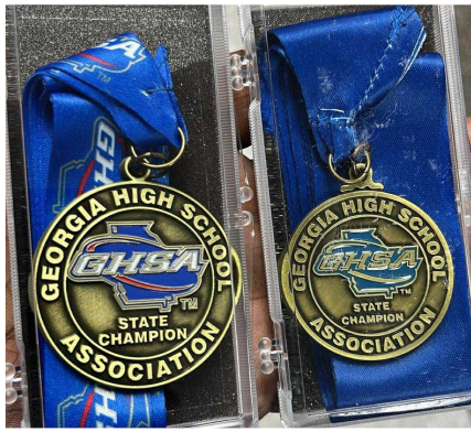
Front Side (New vs Retired)