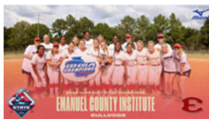
A - Division 2: Emanuel County Institute