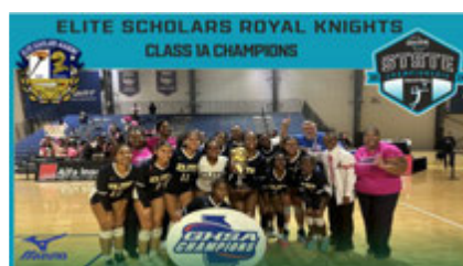
1A: Elite Scholars