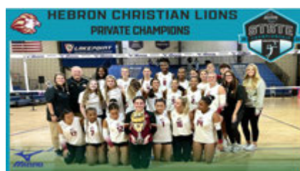
Private: Hebron Christian