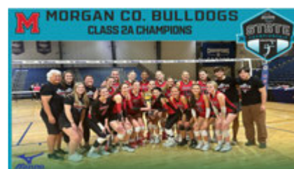
2A: Morgan County