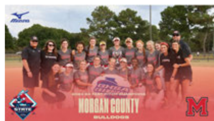
2A: Morgan County