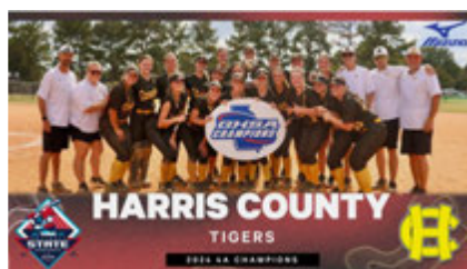
4A: Harris County