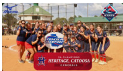
3A: Heritage, Catoosa