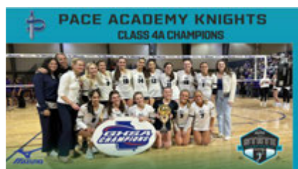
4A: Pace Academy