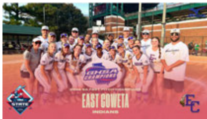
6A: East Coweta