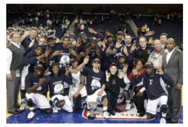
Class AAAAA Boys Champion: Norcross