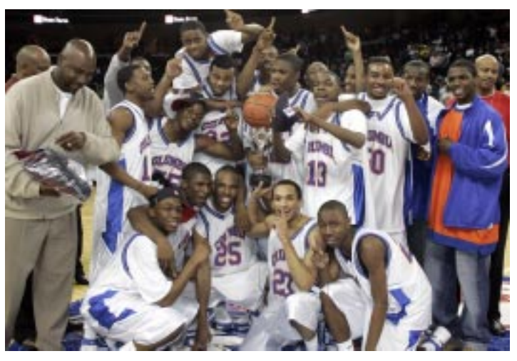
Class AAAA Boys Champion: Columbia