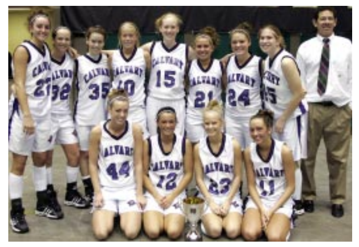
Class A Girls Champion: Calvary Day