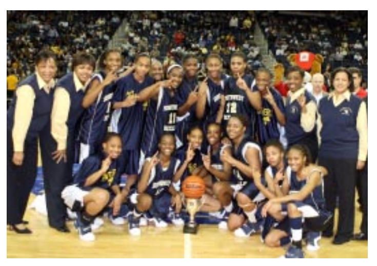
Class AAAA Girls Champion: SW DeKalb