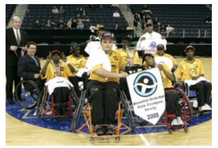
Wheelchair Champion: Atlanta Wolfpack