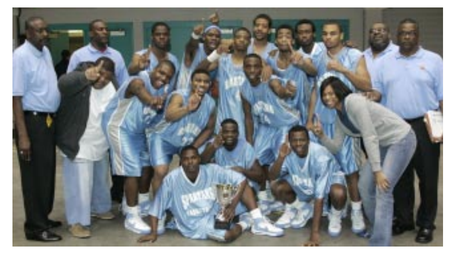
Class AAA Boys Champion: Glenn Hills