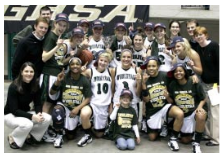
Class AA Girls Champion: Wesleyan