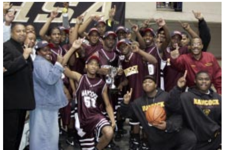
Class A Boys Champion: Hancock Central