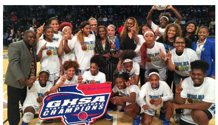
7A Girls: Westlake