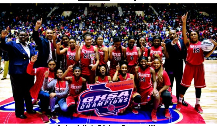
A (public) Girls: Greenville