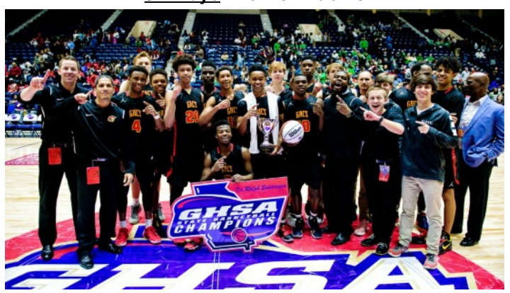
3A Boys: Greater Atlanta Christian