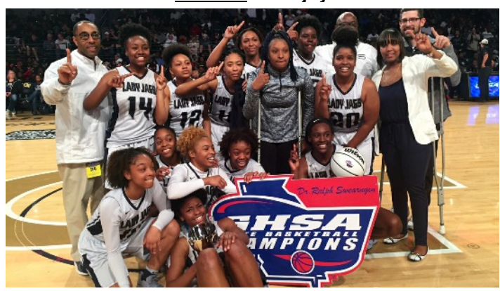
4A Girls: Spalding