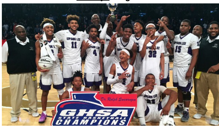
4A Boys: Upson-Lee