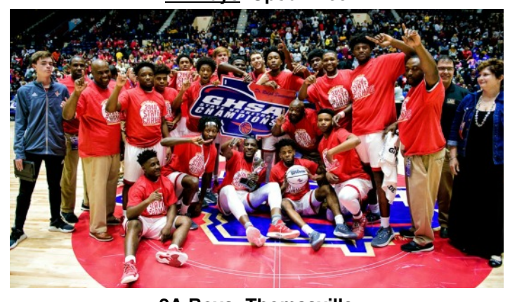
2A Boys: Thomasville