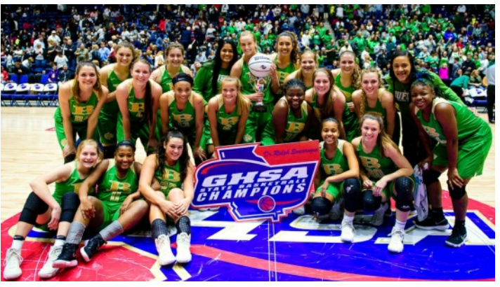
5A Girls: Buford