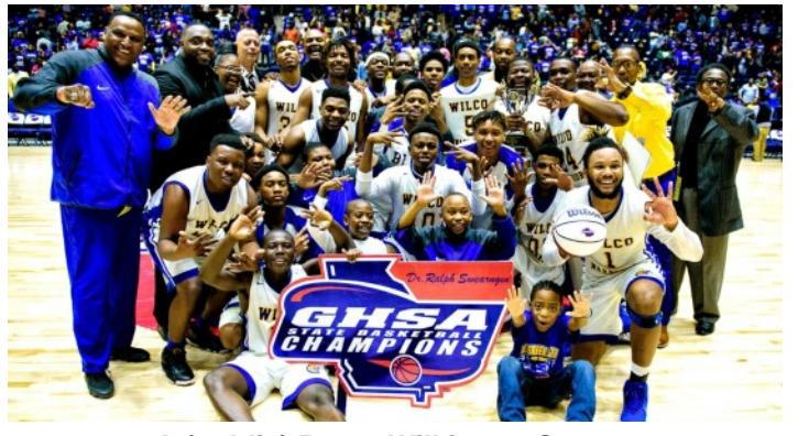
A (public) Boys: Wilkinson County