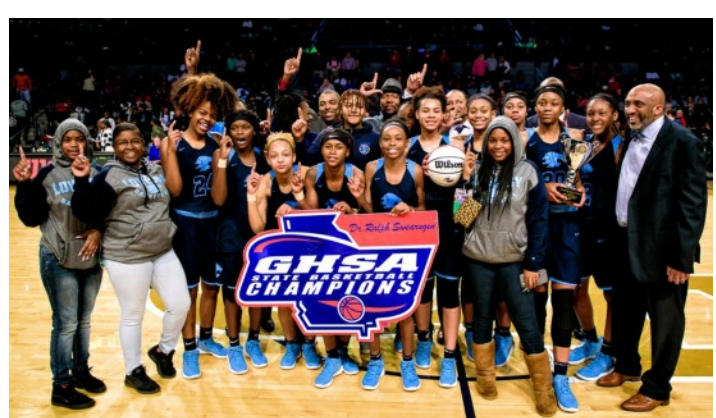
6A Girls: Lovejoy