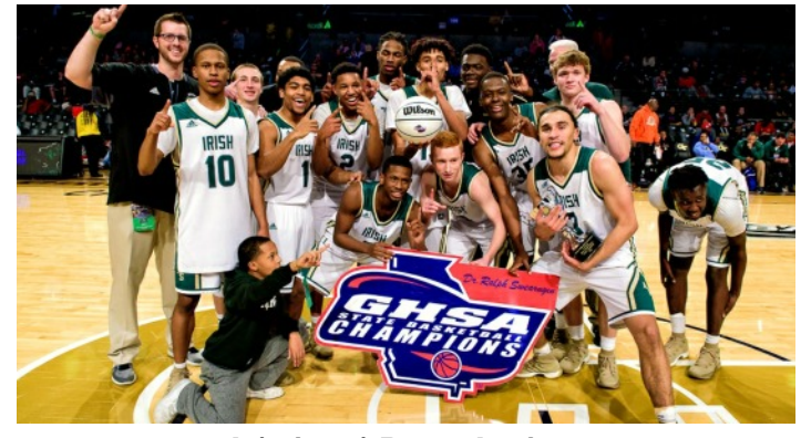
A (private) Boys: Aquinas