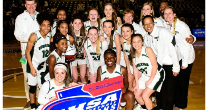
A (private) Girls: Wesleyan