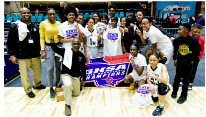
2A Girls: Douglass-Atlanta