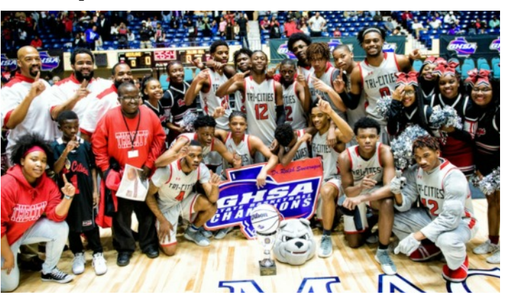
6A Boys: Tri-Cities