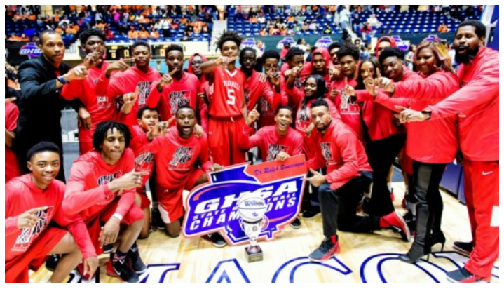
2A Boys: Therrell