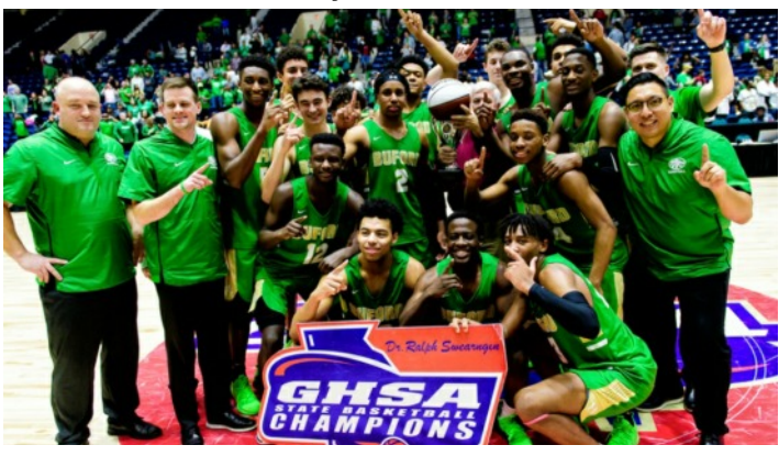
5A Boys: Buford