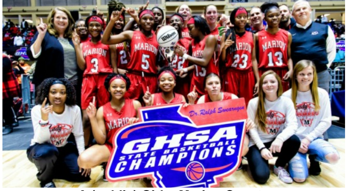
A (public) Girls: Marion County