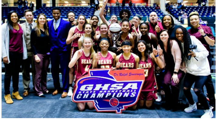
A (private) Girls: Holy Innocents'