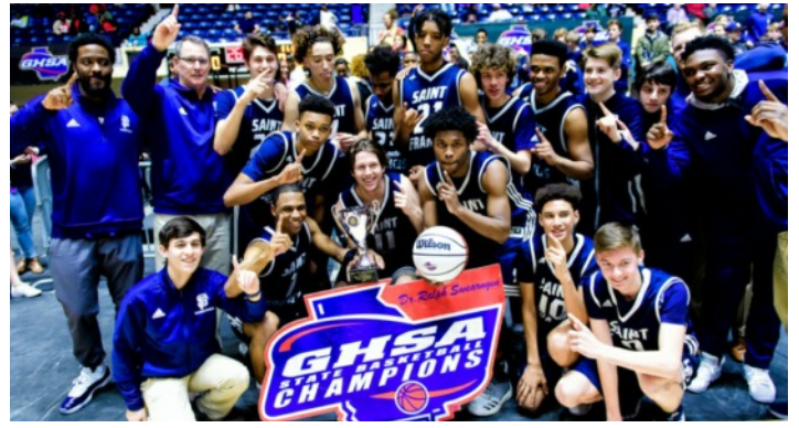
A (private) Boys: St. Francis