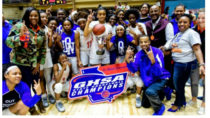
3A Girls: Johnson-Savannah