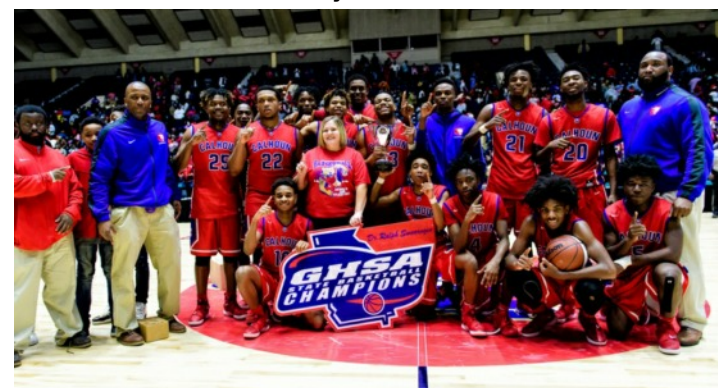
A (public) Boys: Calhoun County