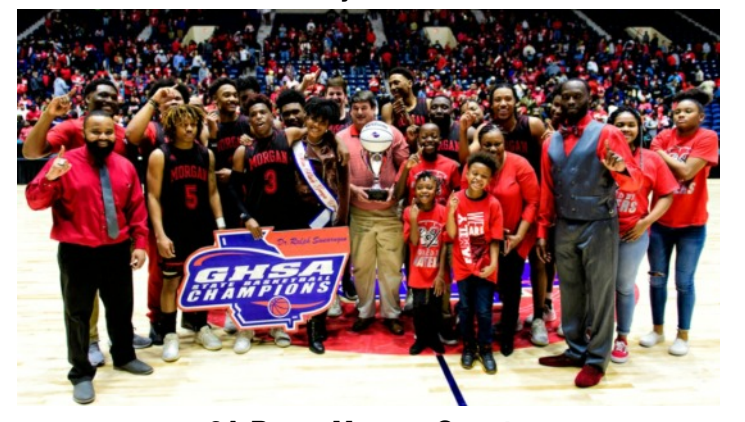
3A Boys: Morgan County