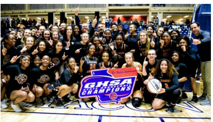
6A Girls: Lanier