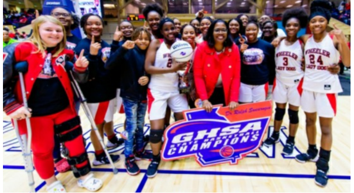
A Public Girls: Wheeler County