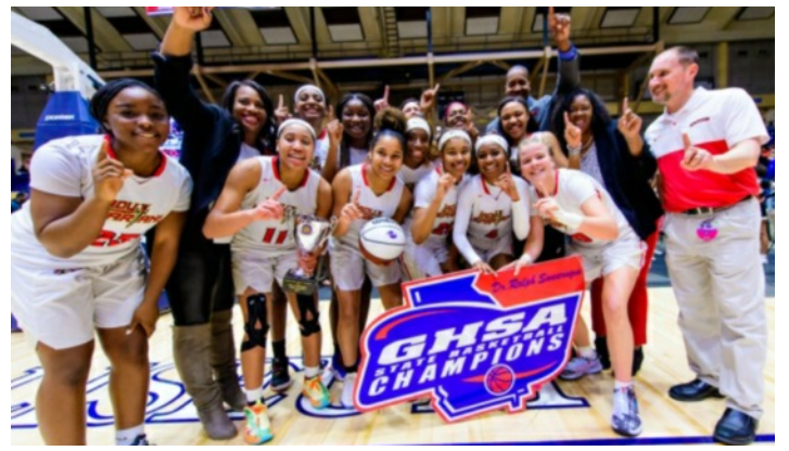
3A Girls: Greater Atlanta Christian