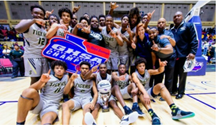
2A Boys: Swainsboro