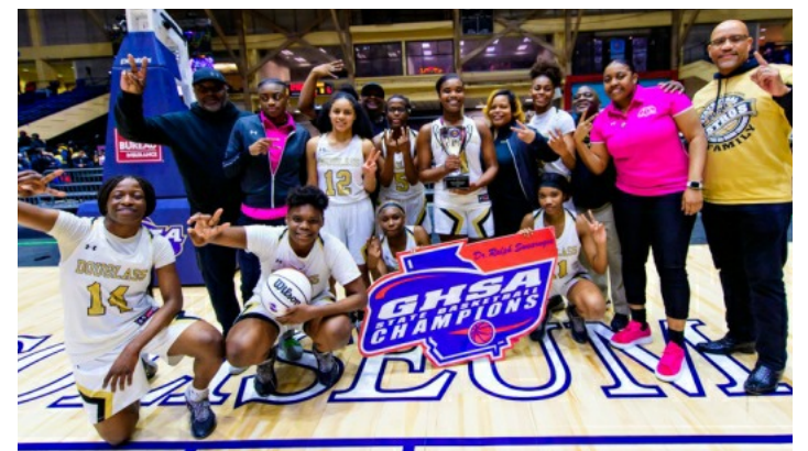
2A Girls: Douglass-Atlanta