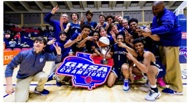
A Private Boys: St. Francis