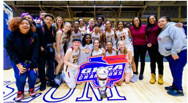
A Private Girls: Holy Innocents'