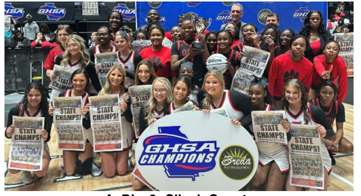
A, Div. 2: Clinch County