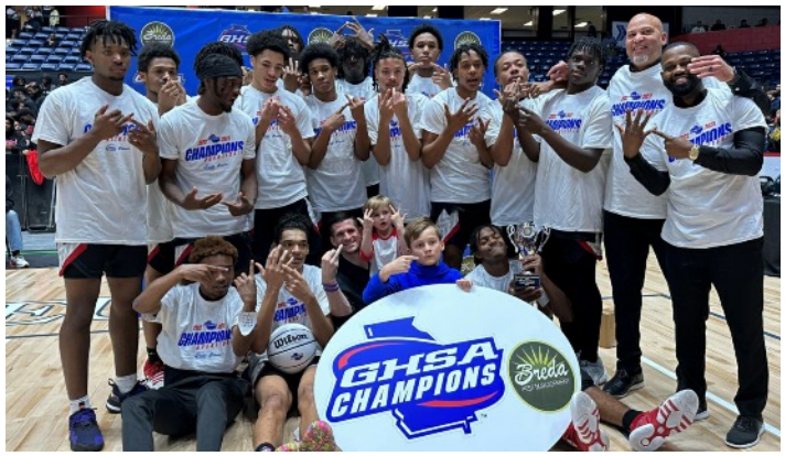
3A: Sandy Creek