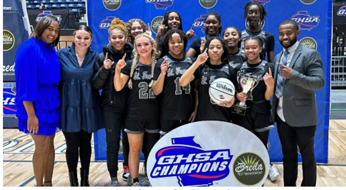
A, Div. 1: St. Francis