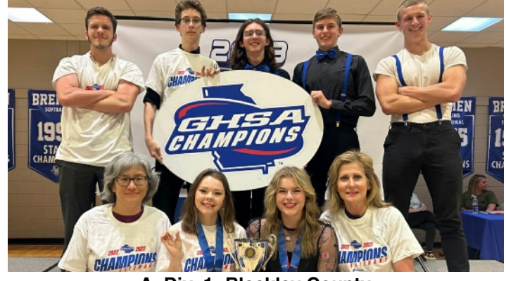
A, Div. 1: Bleckley County