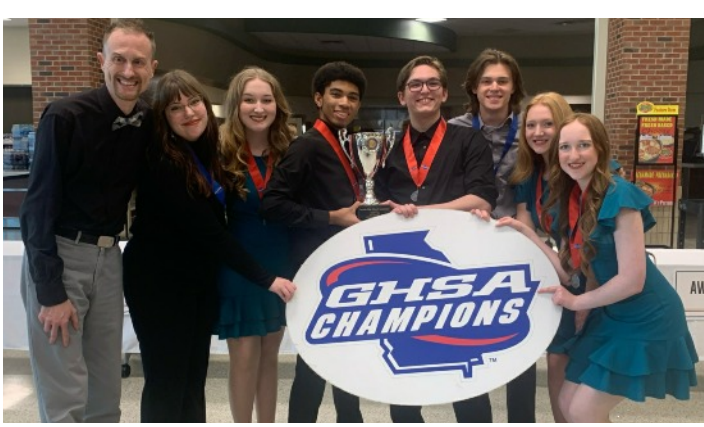
6A: Houston County