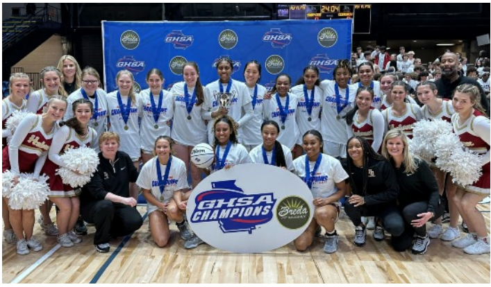
3A: Hebron Christian