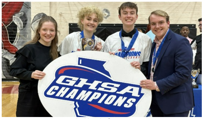
4A: North Oconee