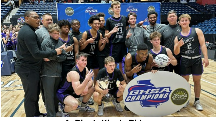
A, Div. 1: King's Ridge