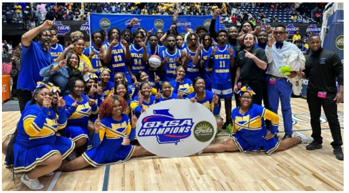
A, Div. 2: Wilkinson County