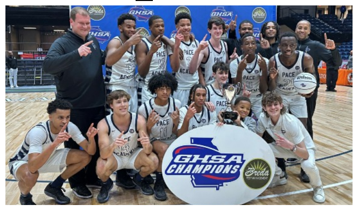
4A: Pace Academy