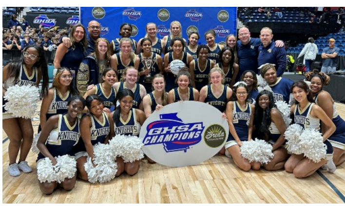
6A: River Ridge