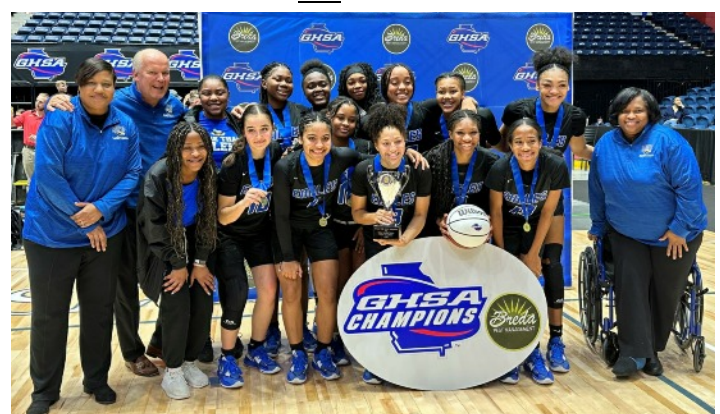
2A: Mt. Paran