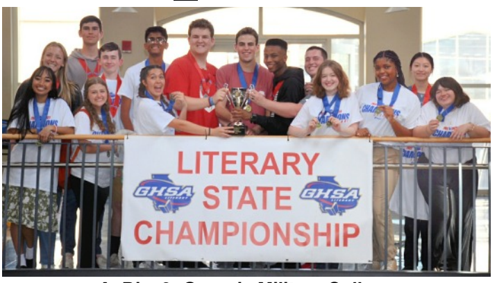
A, Div. 2: Georgia Military College