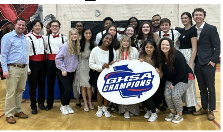
5A: Greater Atlanta Christian