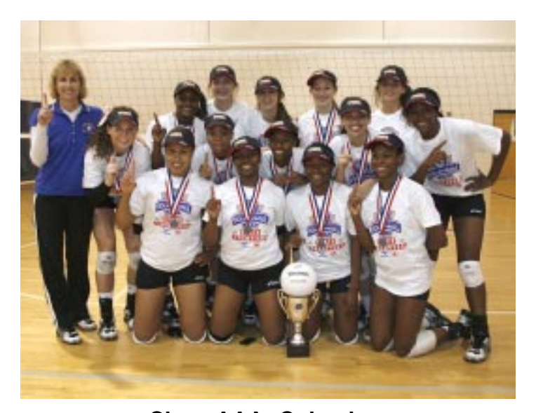
Class AAA: Columbus