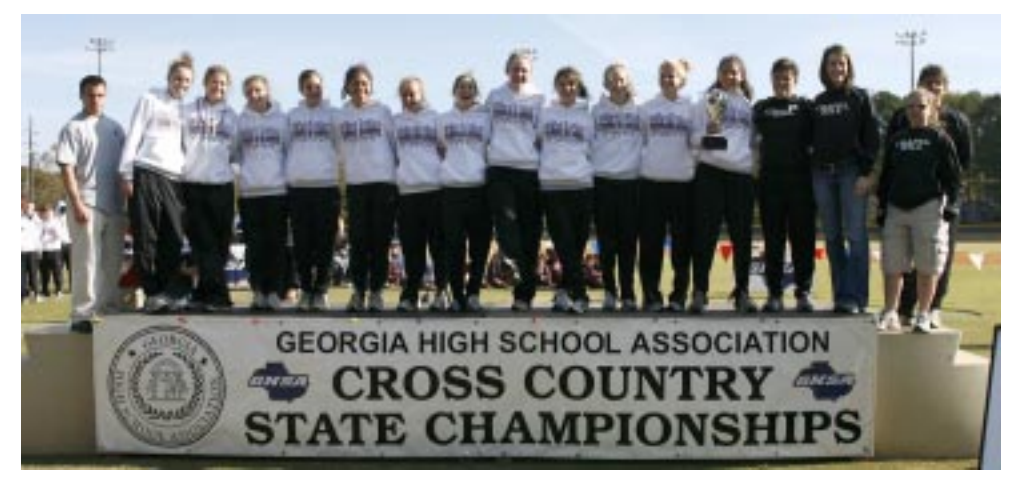
Class AAAA Girls: Chapel Hill