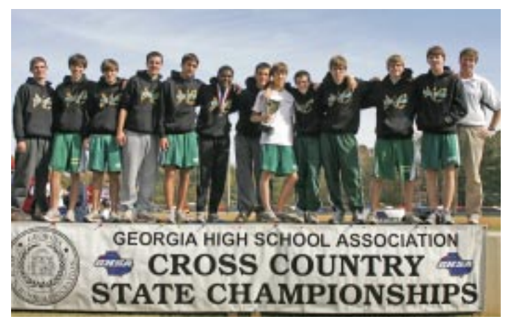
Class AA Boys: Wesleyan