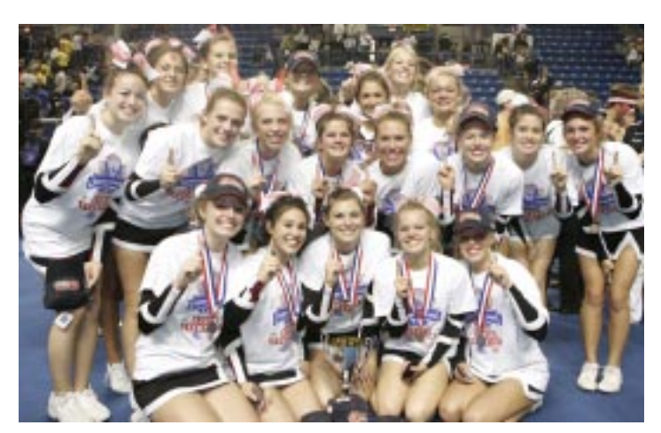
Class AAAA: Northgate