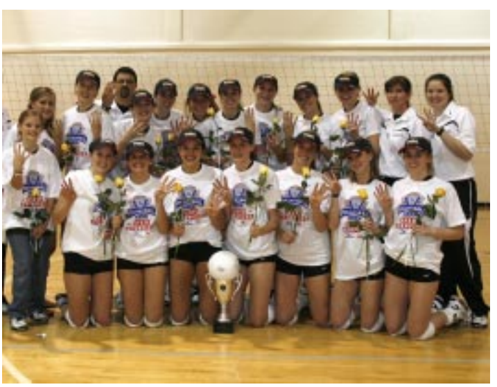
Class AA/A: Wesleyan