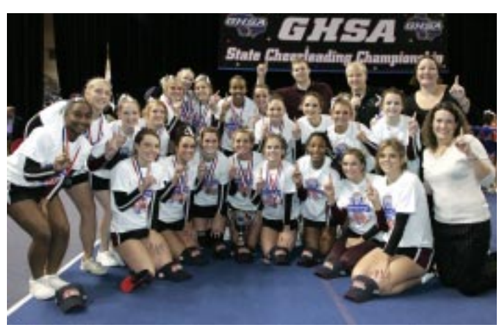
Class AAA: Central-Carrollton