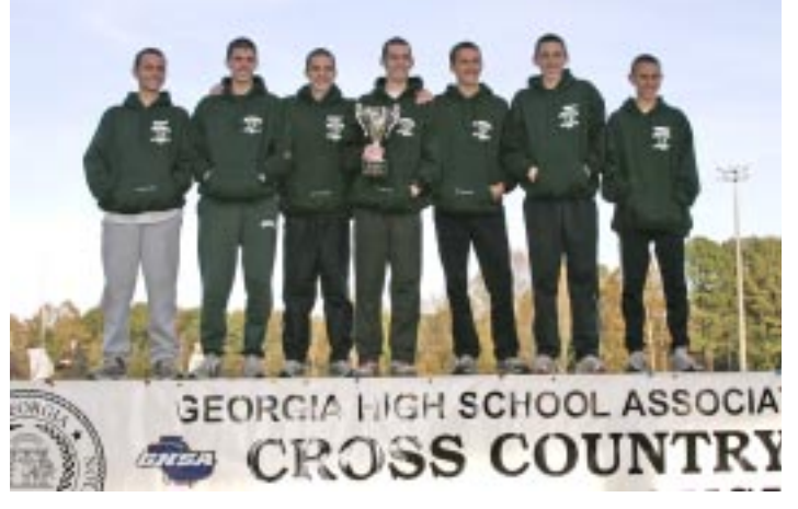
Class AAA Boys: Westminster