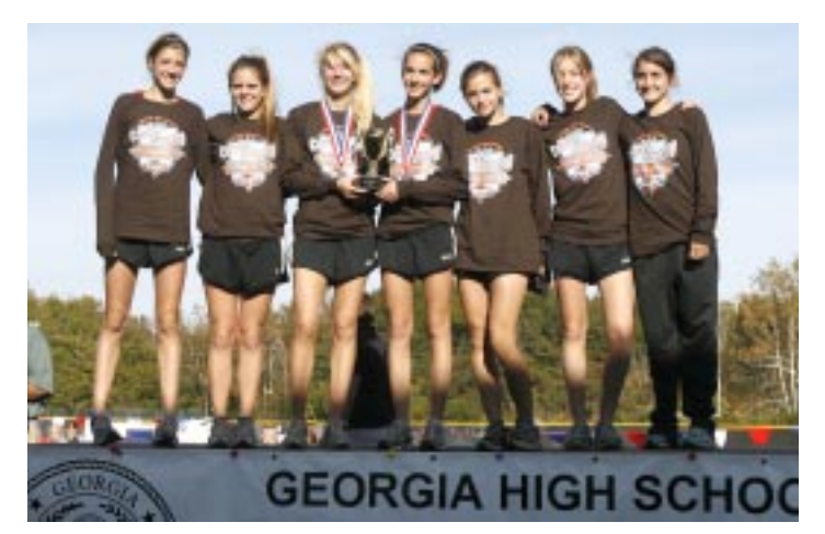
Class AAAAA Girls: Collins Hill