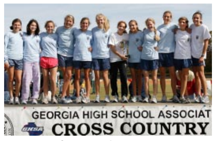
Class AA Girls: Lovett