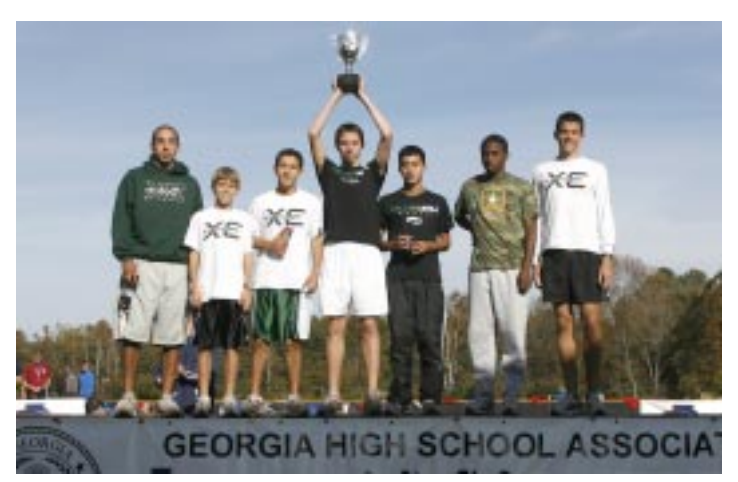
Class AAAAA Boys: Collins Hill