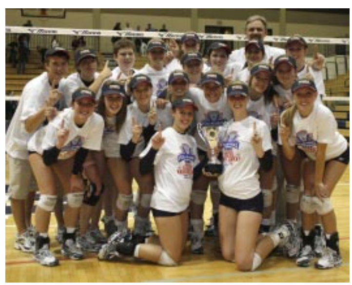
Class AAAAA: Northview