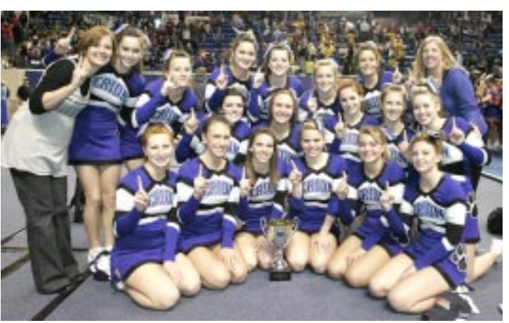
Class A: Trion