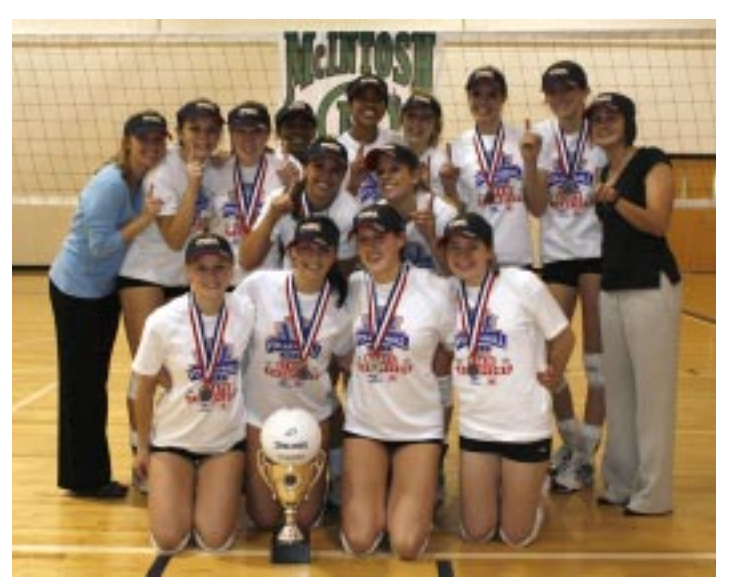
Class AAAA: McIntosh