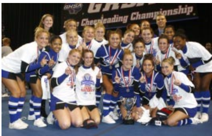
Class AAAAA: Peachtree Ridge