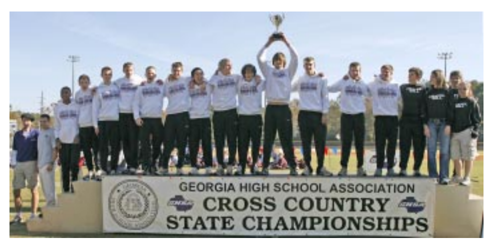
Class AAAA Boys: Chapel Hill