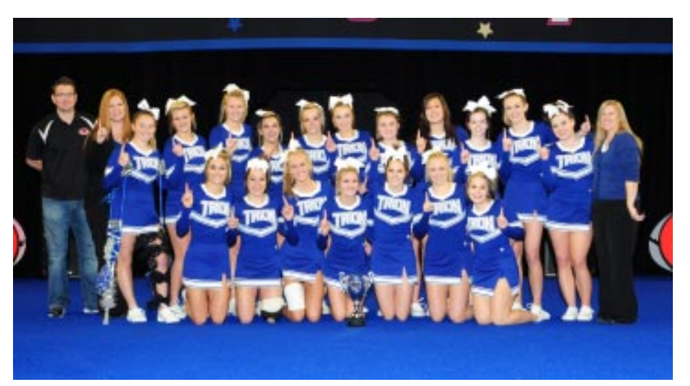
<u>Class A</u> Trion Lady Bulldogs

Photographs in this newsletter of the state championship cheerleading teams were provided by Georgia Photographics . More images may be found and purchased at GHSAphotos.com .