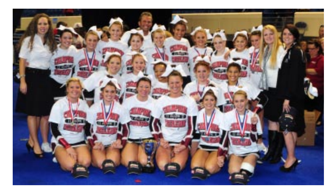
Class AAAA Northgate Lady Vikings