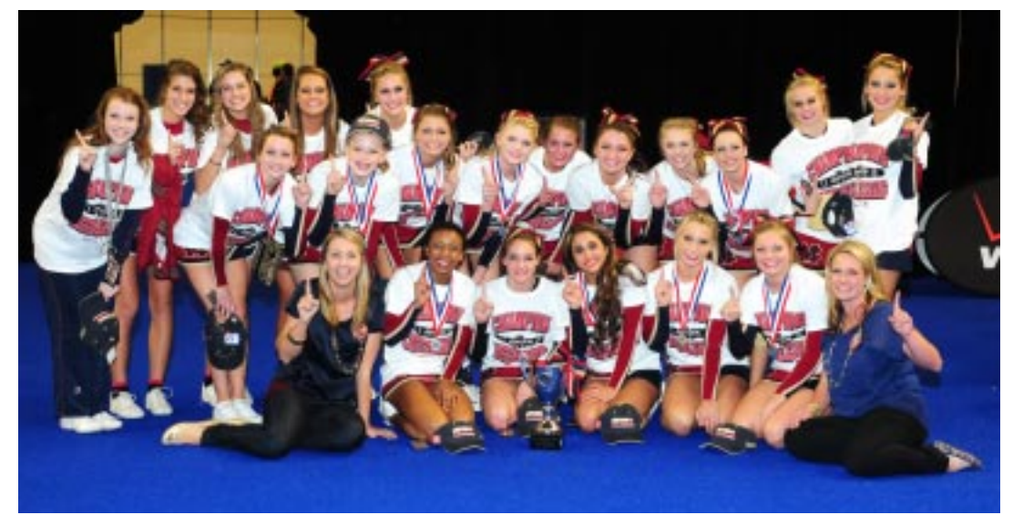
Class AAAAA Mill Creek Lady Hawks