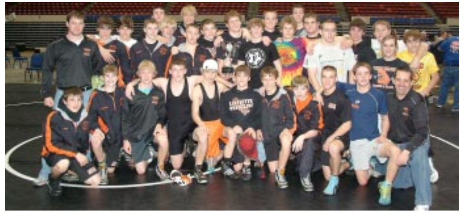
Class AA: LaFayette