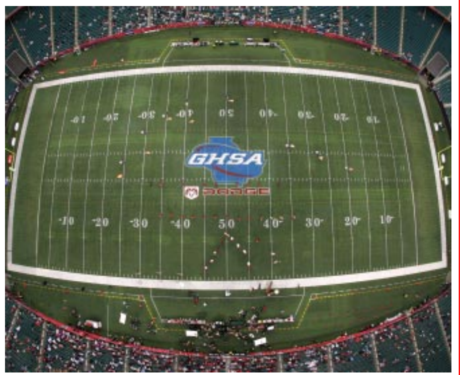
An overhead view of the Georgia Dome shows the Dodge logo at midfield.

The GHSA greatly appreciates the outstanding support of Dodge dealers throughout the state and encourages everyone to "Grab Life." For a full list of Dodge products go to <a href="https://www.dodge.com">www.dodge.com</a>.