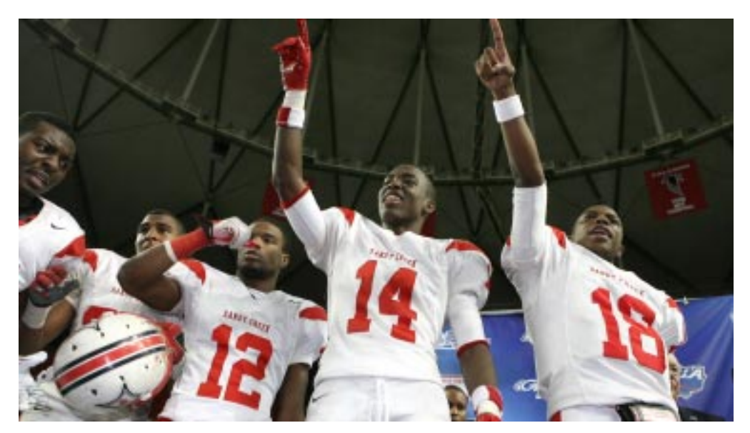
<u>Class AAA</u> Sandy Creek Fighting Patriots