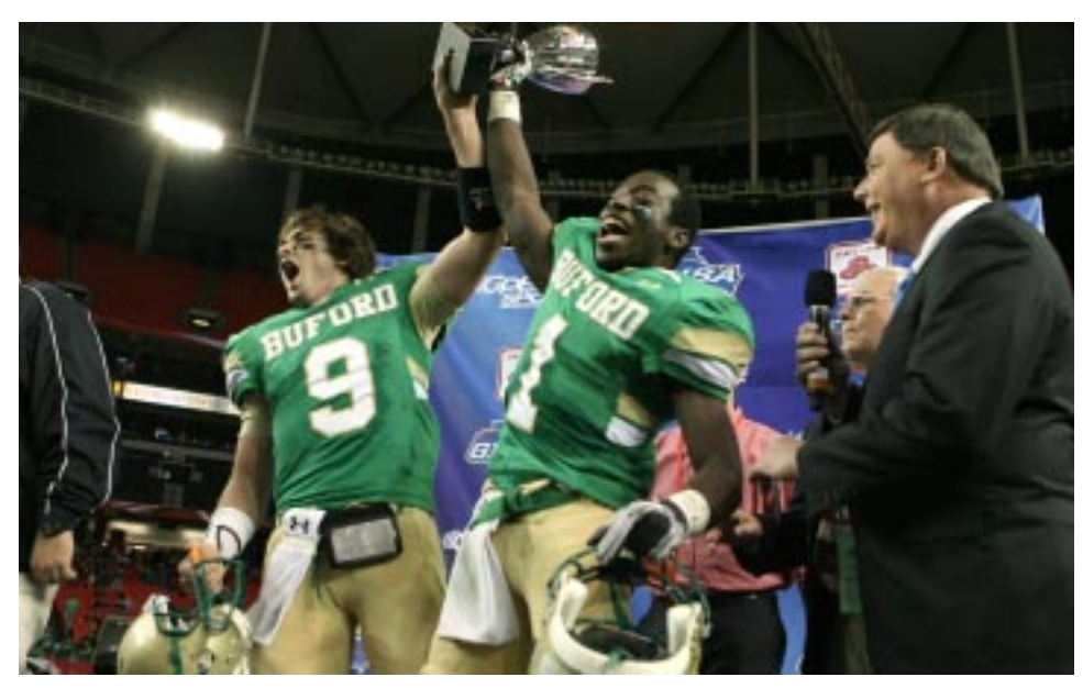
<u>Class AA</u> Buford Wolves