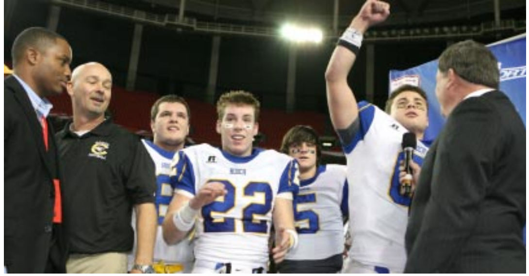
<u>Class AAAA</u> Chattahoochee Cougars