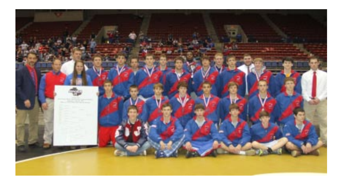
Class AA Jefferson Dragons

<u>Class A</u> Holy Innocents' Golden Bears