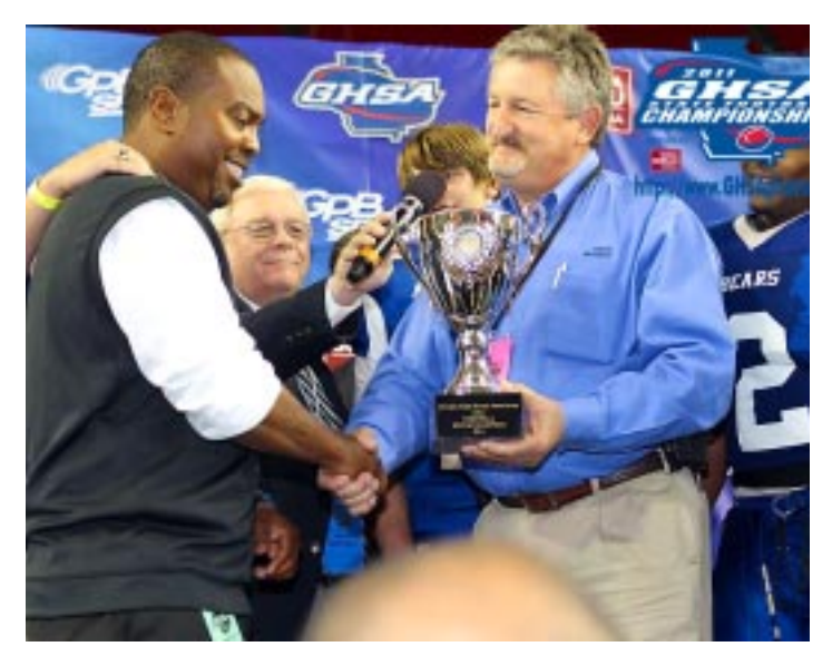
<u>Class AAA</u> Burke County Bears