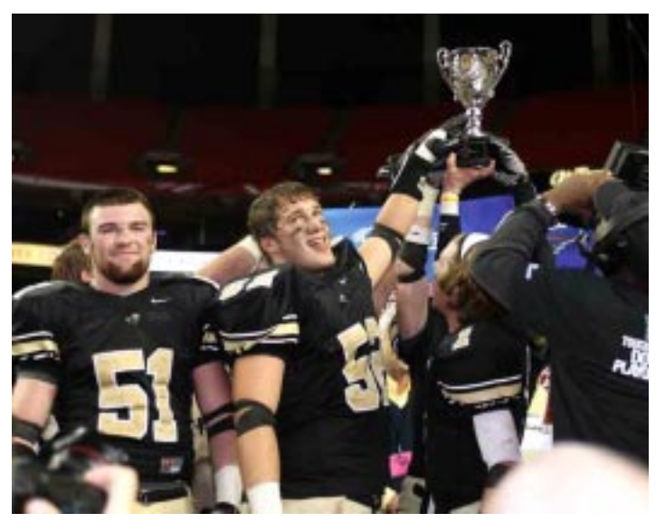
<u>Class AA</u> Calhoun Yellow Jackets