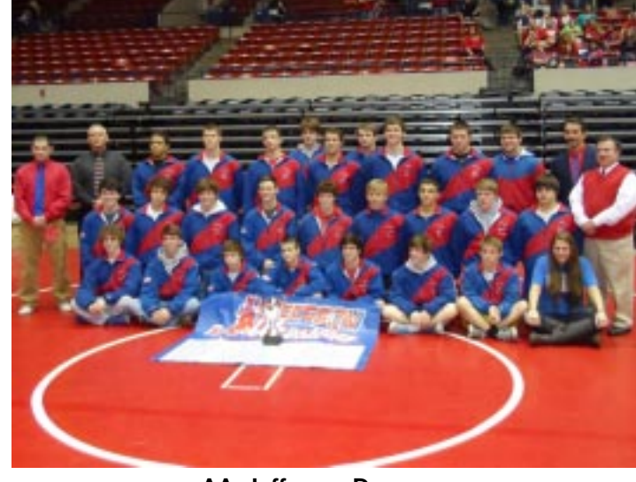
AA : Jefferson Dragons