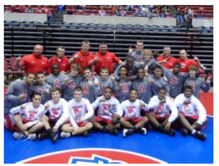
AAAAA: Archer Tigers