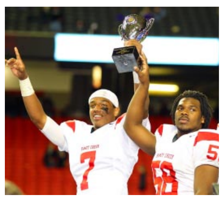
Class AAAA Sandy Creek Fighting Patriots