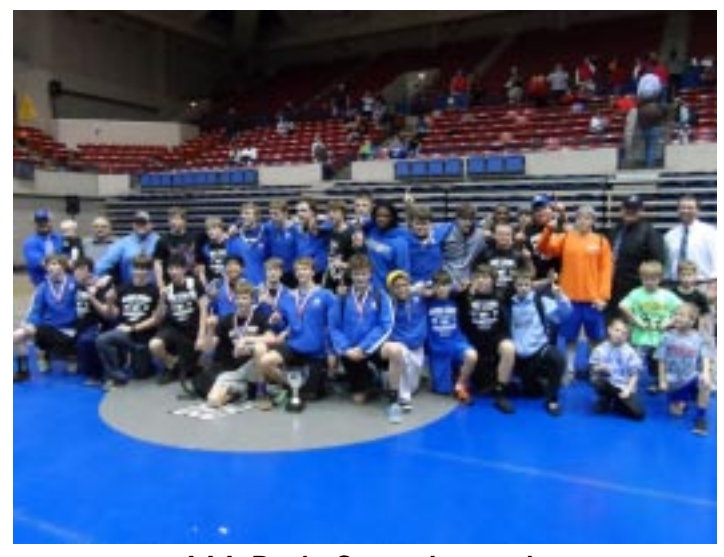
AAA : Banks County Leopards