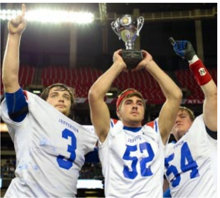
Class AA Jefferson Dragons