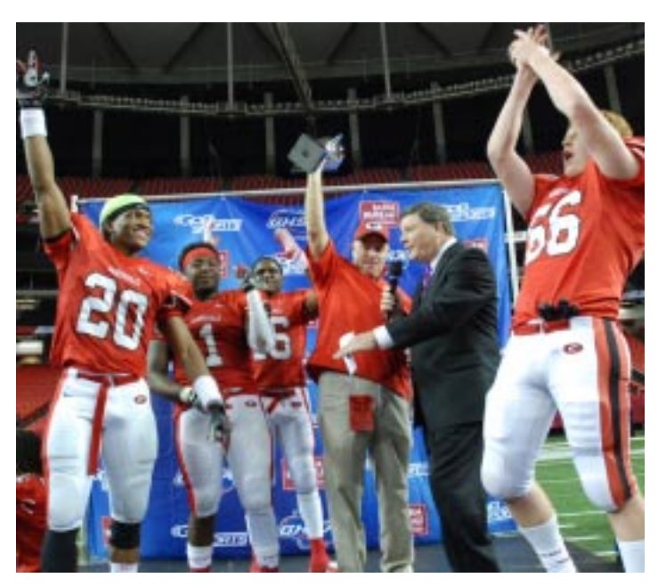
Class AAAAA Gainesville Red Elephants