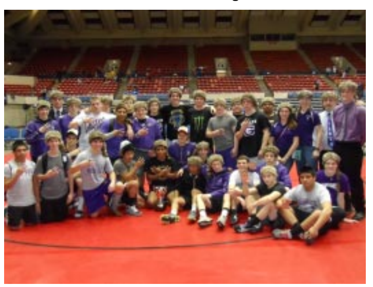
AAAA: Gilmer Bobcats