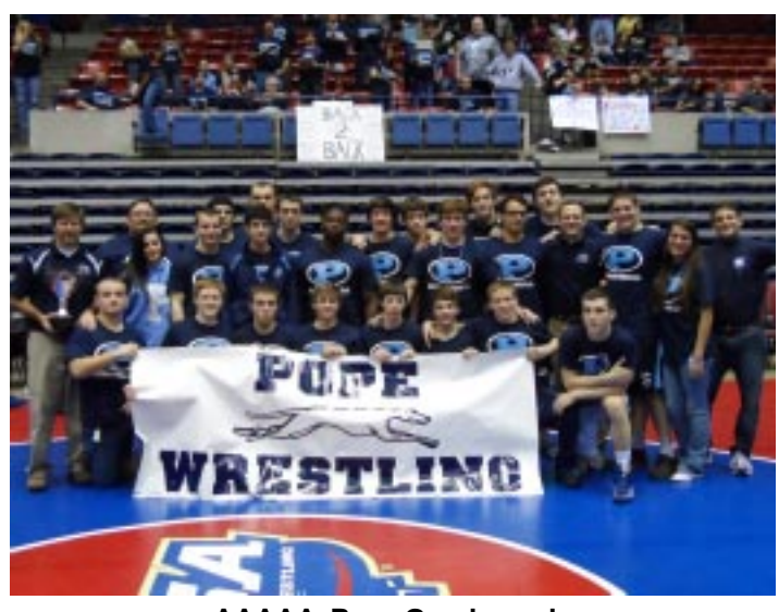
AAAA : Pope Greyhounds