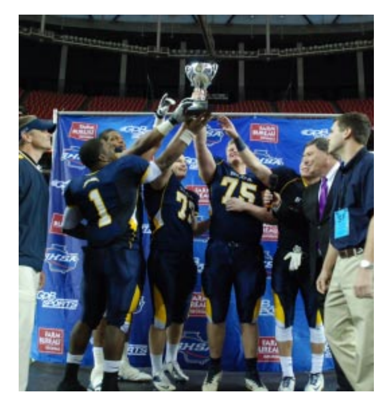
Class A (Private School) Eagles Landing Christian Chargers