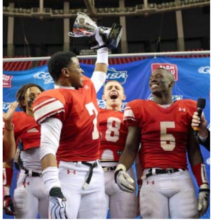
Class A (Public School) Emanuel County Institute Bulldogs