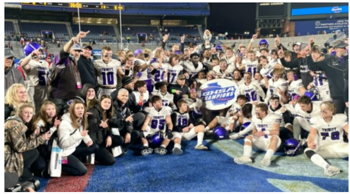
A Private: Trinity Christian