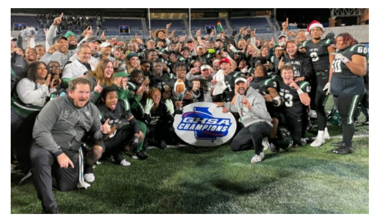
7A: Collins Hill