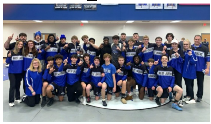
4A: West Laurens