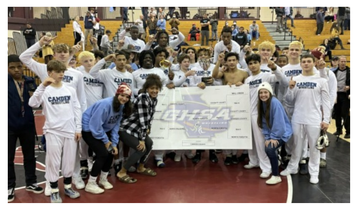
7A: Camden County