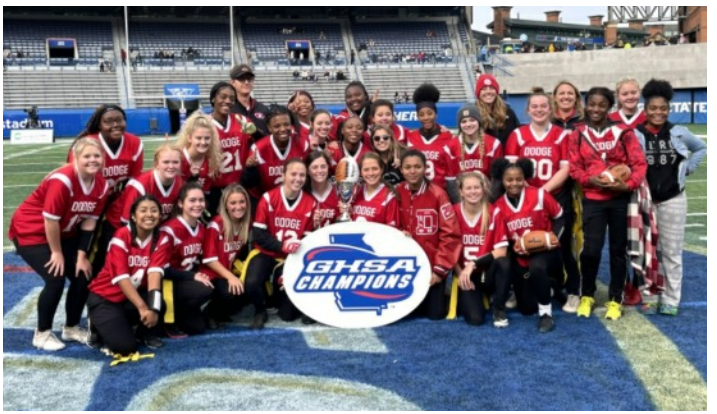
5A-6A: Dodge County