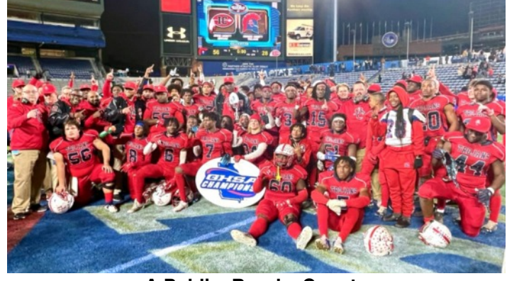
A Public: Brooks County