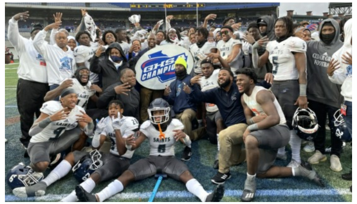
3A: Cedar Grove