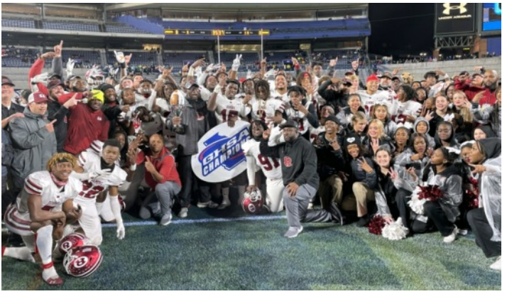
5A: Warner Robins