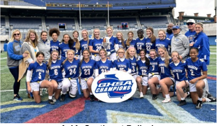
A-4A: Southeast Bulloch