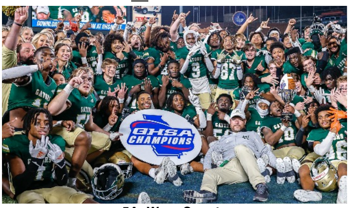
5A: Ware County