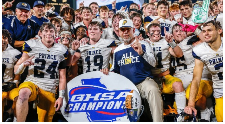
A, Division 1: Prince Avenue