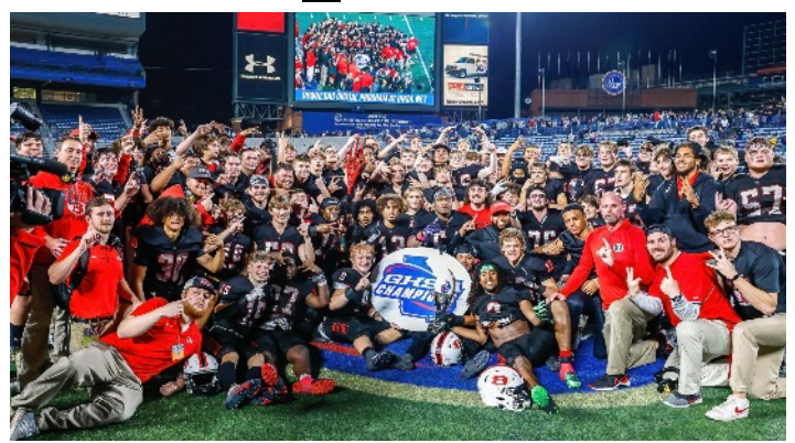
A, Division 2: Bowdon