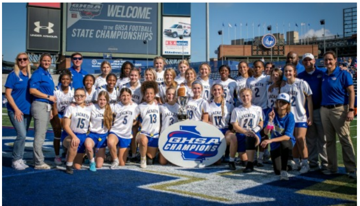
A-4A: Southeast Bulloch