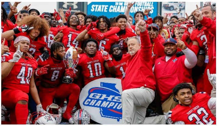
3A: Sandy Creek