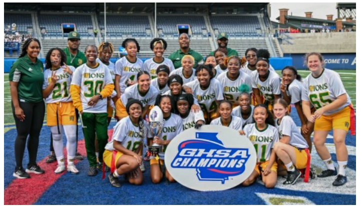
5A-6A: Lithia Springs