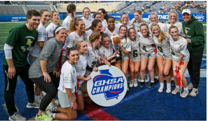
7A: Blessed Trinity

Congratulations to the third ever GHSA Flag Football State Champions. A third division was added in 2021 after two champs were crowned during the initial campaign in 2020. Winning in 2022 were Blessed Trinity (7A), Lithia Springs (5A-6A) and Southeast Bulloch repeating in A-4A. Photos of the other Football champions may be found on the next page.