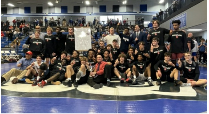
A: Mt. Pisgah