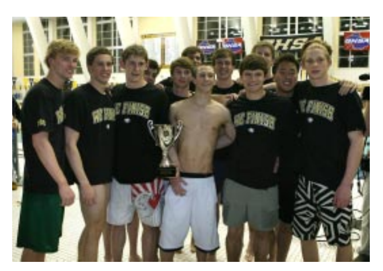
Class A-AAAA Boys Champion: Wesleyan