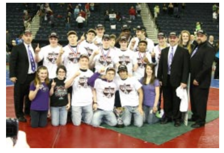
Class AAA Champion: Gilmer