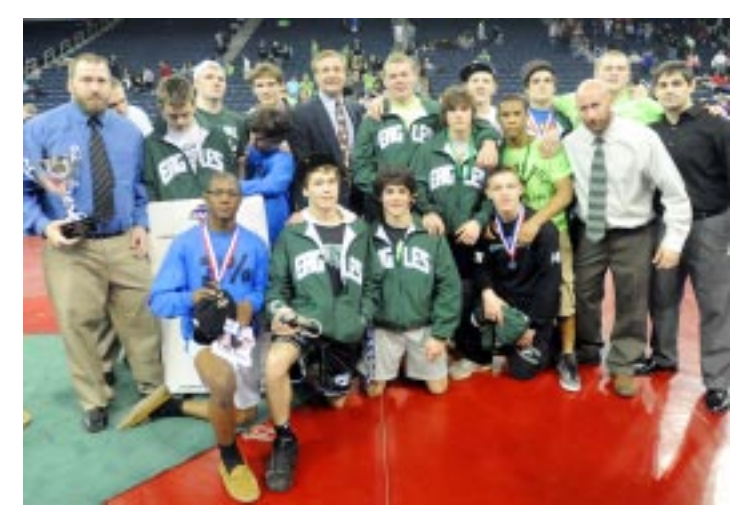
Class AAAAA Champion: Collins Hill