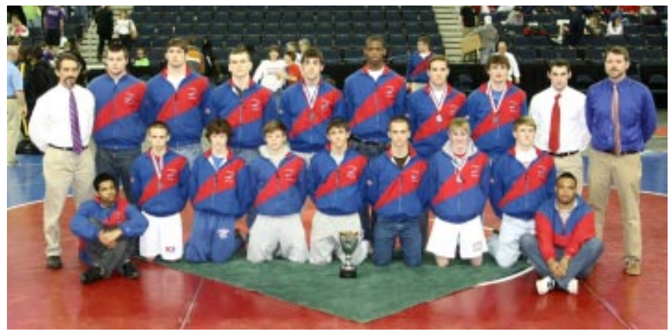
Class AA Champion: Jefferson