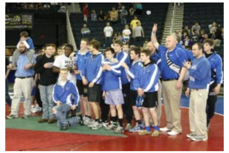
Class A Champion: Bremen