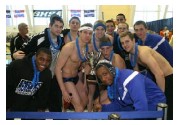
Class AAAAA Boys Champion: Peachtree Ridge