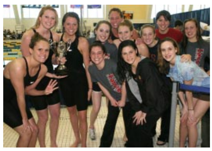
Class AAAAA Girls Champion: Lassiter