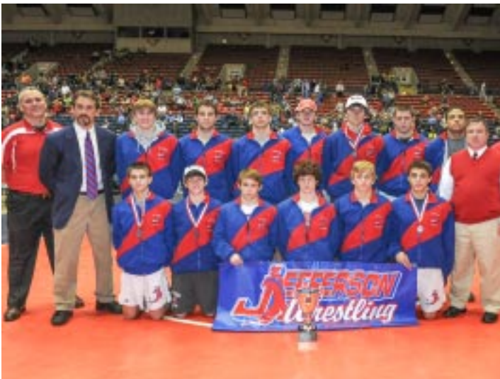
AA: Jefferson Dragons