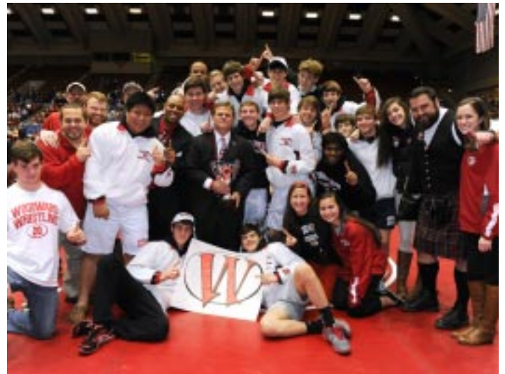
AAA: Woodward Academy War Eagles