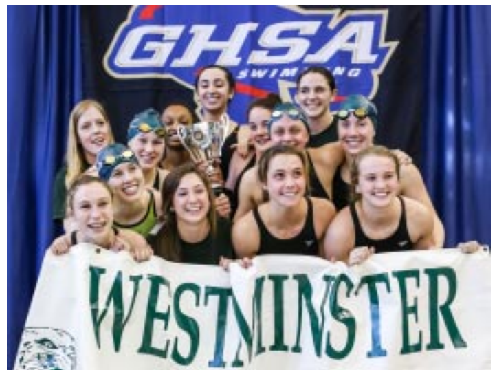
Class A-AAAAA Girls Champion: Westminster

Photographs of the state championship Swimming teams were provided by River Oak Photography . Action photos from swimming may be found at RiverOakPhotography.com . Photos of the State Traditional Wrestling champions on the next page were provided by Georgia Photographics . Action photos from wrestling may be found and purchased at GHSAPhotos.com .