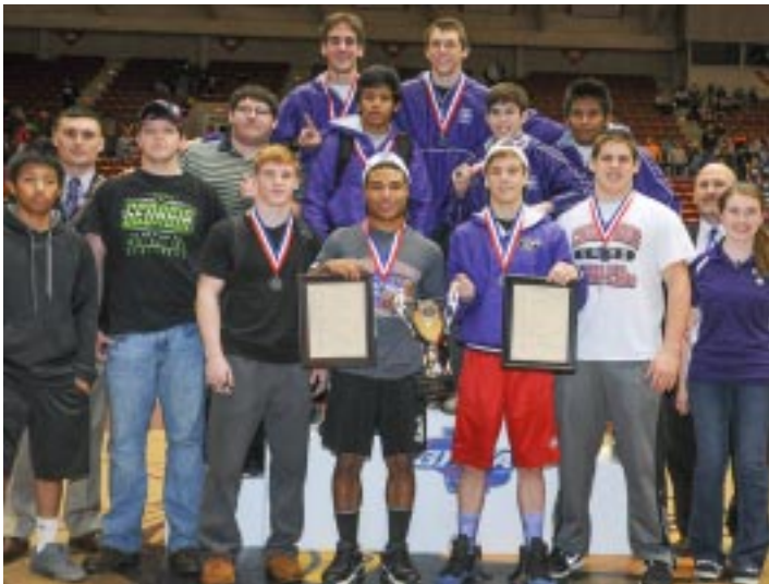
AAAA: Gilmer Bobcats