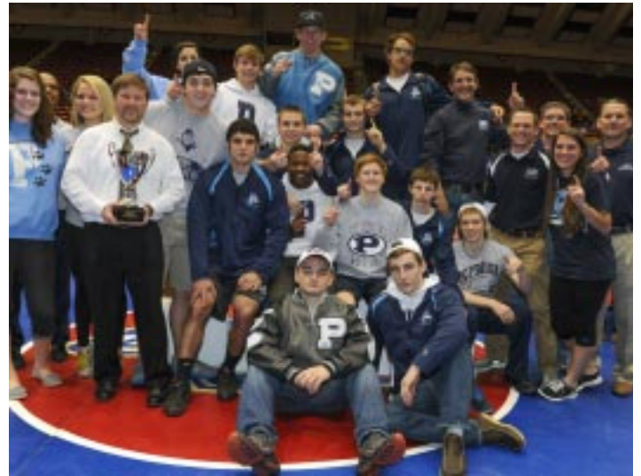
AAAAA: Pope Greyhounds