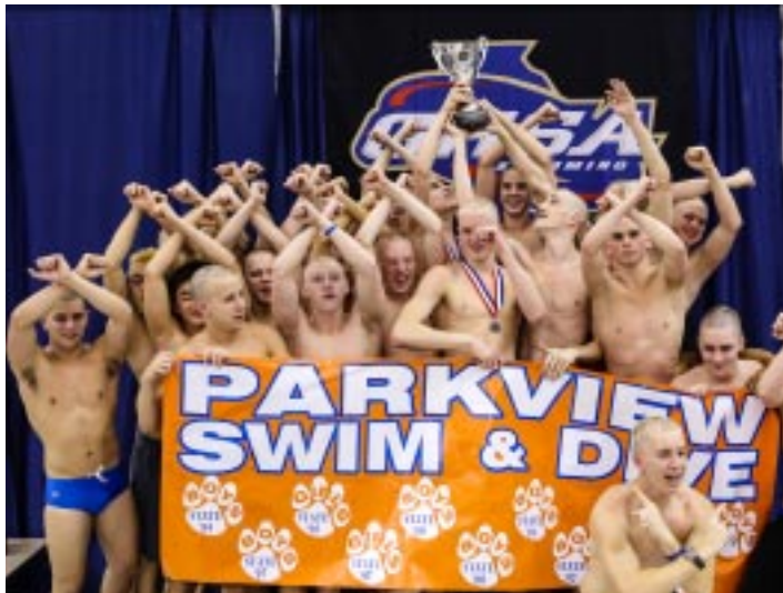
Class AAAAA Boys Champion: Parkview