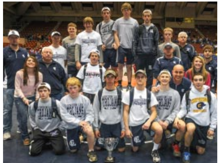
A: Gordon Lee Trojans