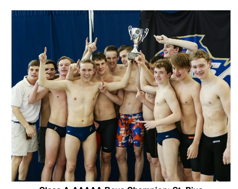
Class A-AAAAA Boys Champion: St. Pius