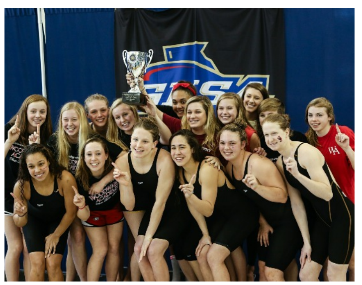
Class A-AAAA Champion: Woodward