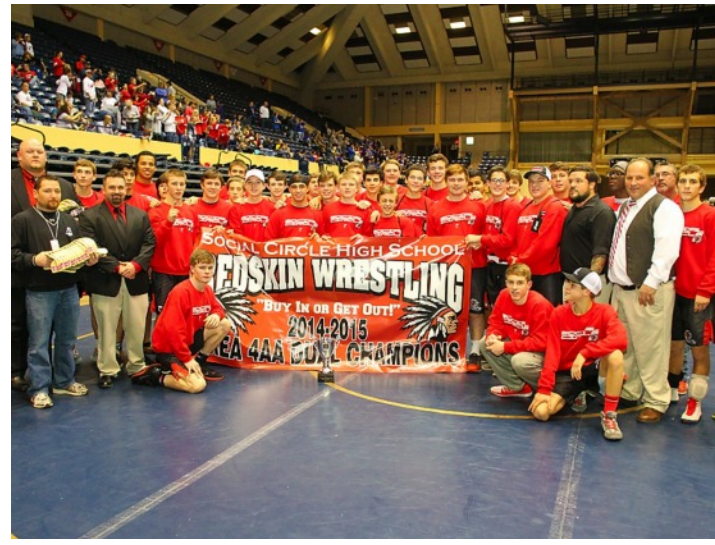
AA: Social Circle