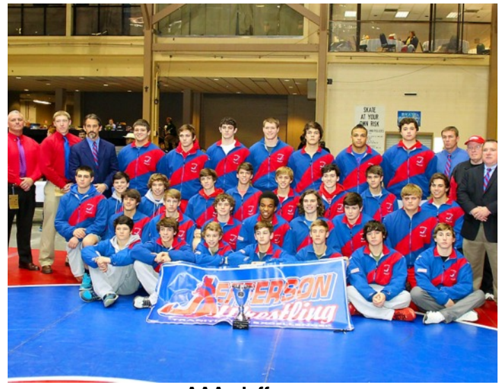
AAA : Jefferson