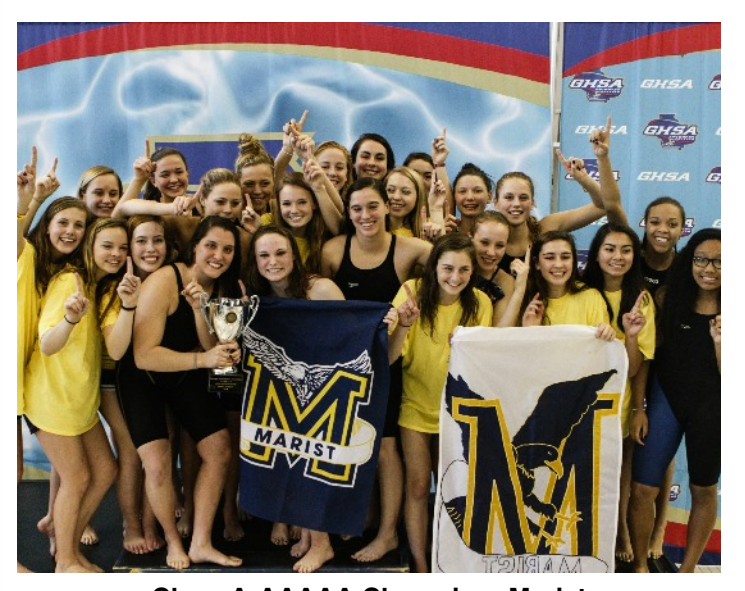
Class A-AAAAA Champion: Marist