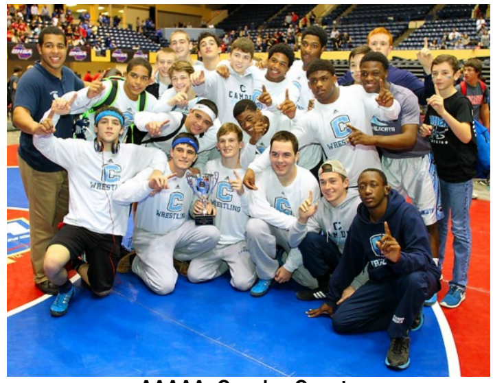
AAAAA: Camden County