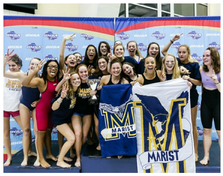
Class A-5A Girls Champion: Marist