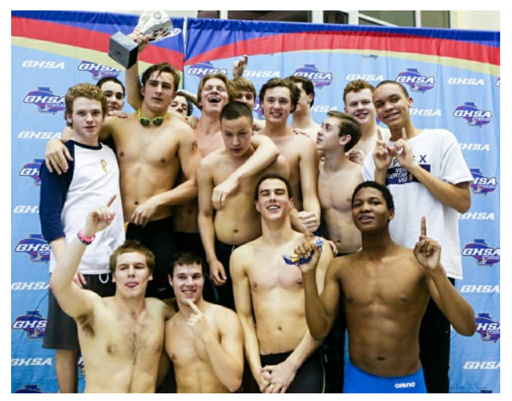
Class A-5A Boys Champion: St. Pius