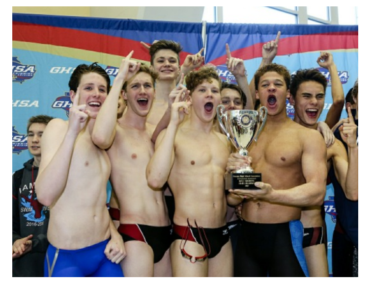
Class 6A-7A Boys Champion: Brookwood