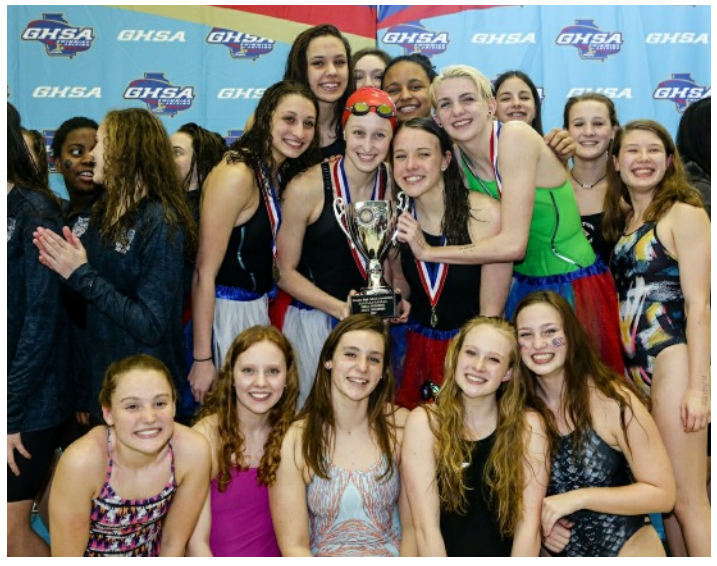
Class 6A-7A Girls Champion: Walton