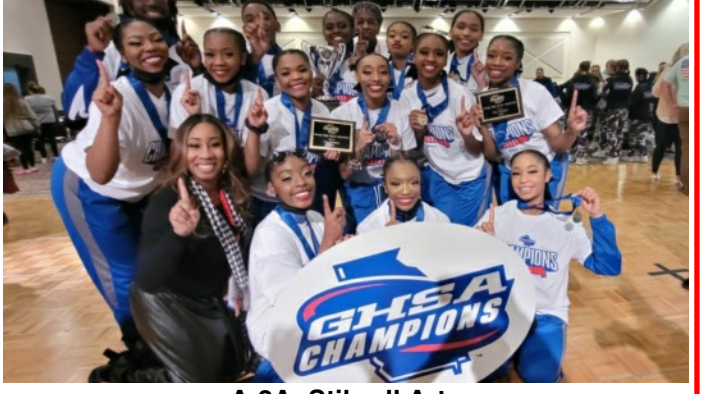
A-2A: Stilwell Arts