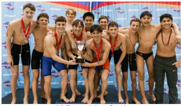
6A Boys: Johns Creek