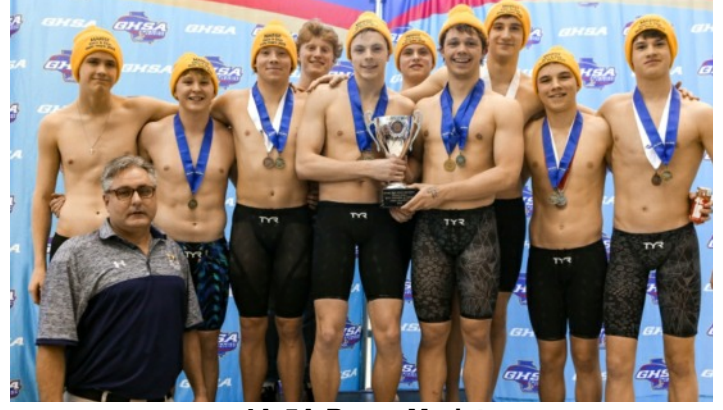
4A-5A Boys: Marist