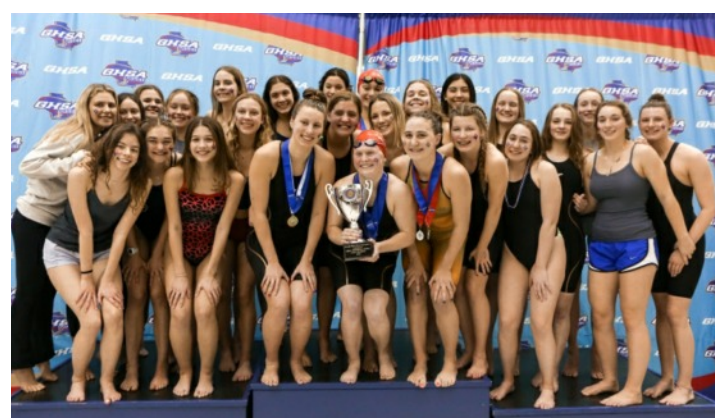
7A Girls: Walton