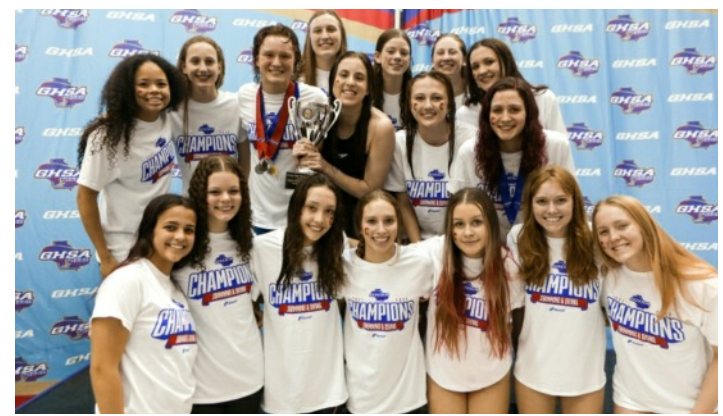
6A Girls: Lassiter