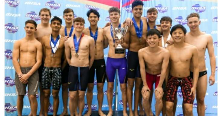
A-3A Boys: Westminster