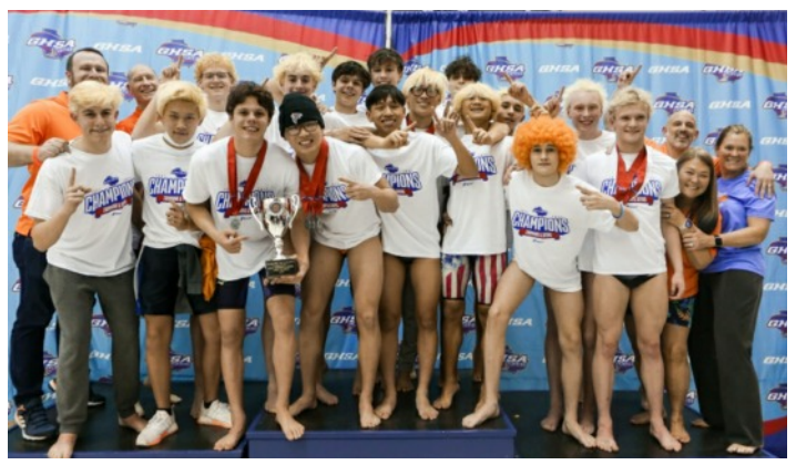
7A Boys: Parkview