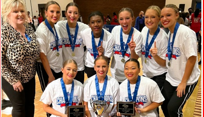
5A-6A: Starr's Mill