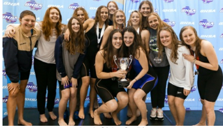
4A-5A Girls: St. Pius