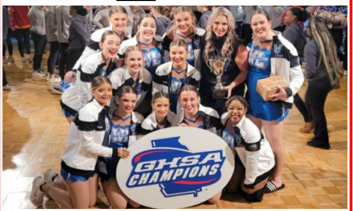
3A-4A: West Laurens