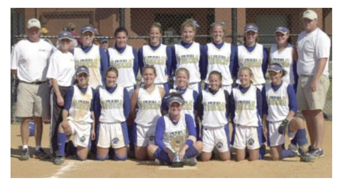
Class AAAA Ringgold Lady Tigers