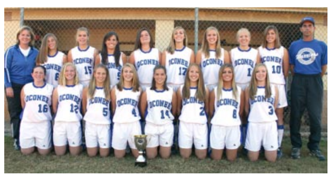
<u>Class AAA</u> Oconee County Lady Warriors